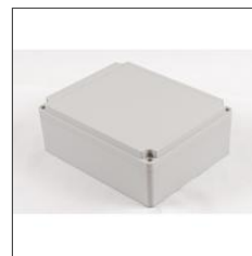
Some models supplied with styled lid.