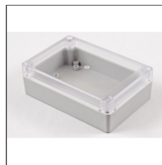
Clear Lid (polycarbonate version shown)