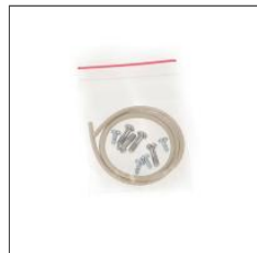
Hardware includes lid screws, PC board screws, and gasket