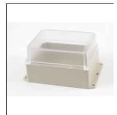
Some models supplied with deep lids.