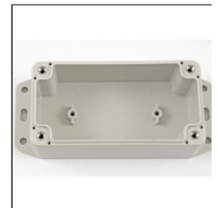
Internal DIN rail mounting point.