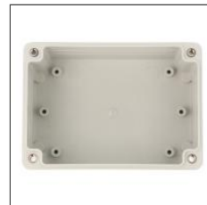
Internal mounting points for PC boards or panels