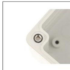
Features corrosion resistant inserts for lid assembly