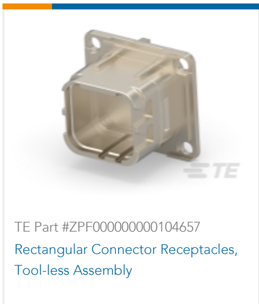
TE Part #ZPF000000000104657 Rectangular Connector Receptacles, Tool-less Assembly