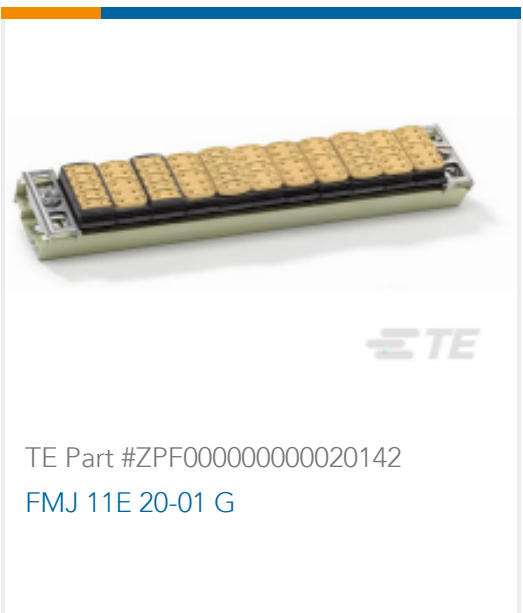
TE Part #ZPF000000000020142 FMJ 11E 20-01 G