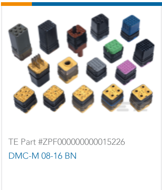
TE Part #ZPF000000000015226 DMC-M 08-16 BN