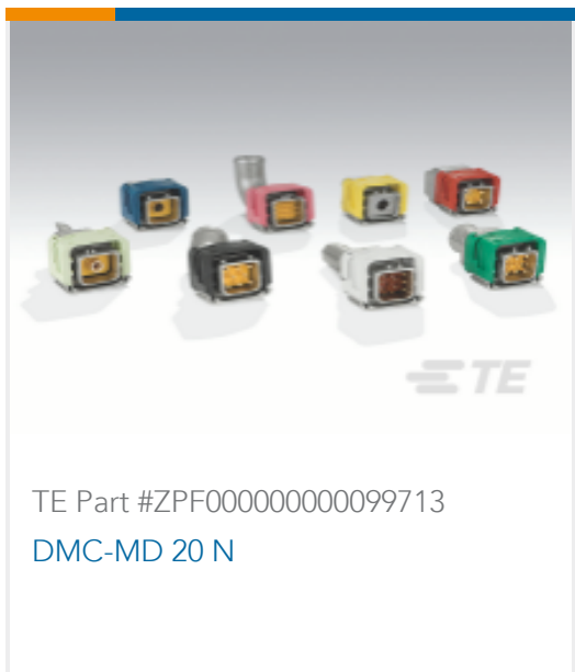
TE Part #ZPF000000000099713 DMC-MD 20 N