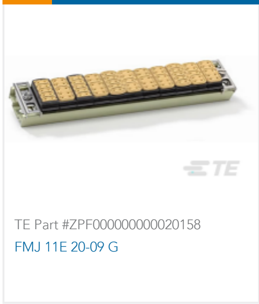
TE Part #ZPF000000000020158 FMJ 11E 20-09 G