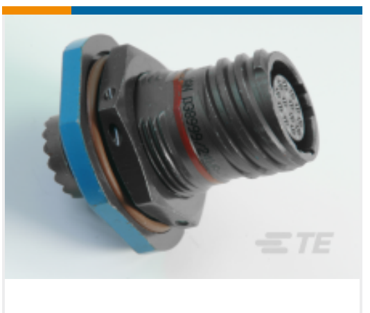
TE Part # CAT-D38999-DTS16G Jam Nut: D38999, 25-35 Insert