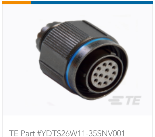
TE Part #YDTS26W11-35SNV001 PLUG ASSY