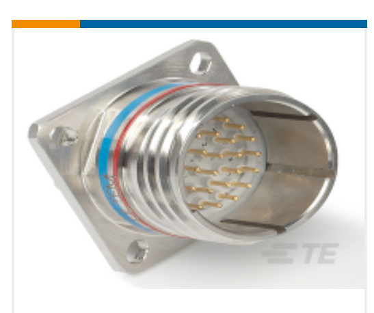
TE Part # CAT-D38999-DTS7S D38999: Square Flange, 25-35 insert