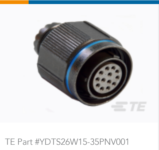
D38999: Straight Plug, 15-35 Insert