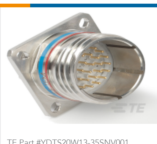
TE Part #YDTS20W13-35SNV001 RECP ASSY