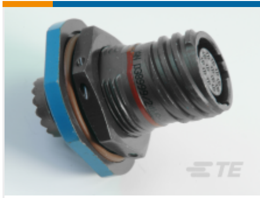
TE Part #YDTS24W15-35PNV001 RECP ASSY