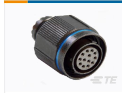
TE Part #YDTS26W15-19SAV001 PLUG ASSY