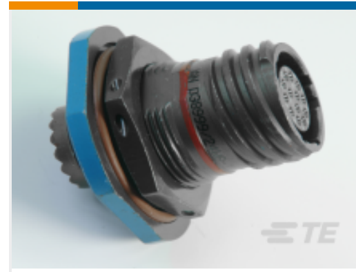
TE Part #YDTS24W19-35SNV001 RECP ASSY