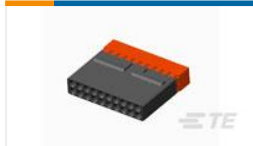
TE Part #494203-000 MTCP-122-20S