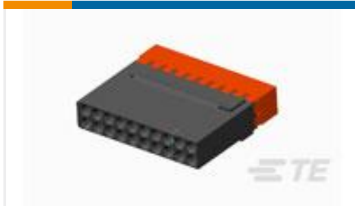
TE Part #253627-000 MTCP-122-20S2