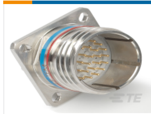
TE Part #YDTS20W15-19PAV001 RECP ASSY