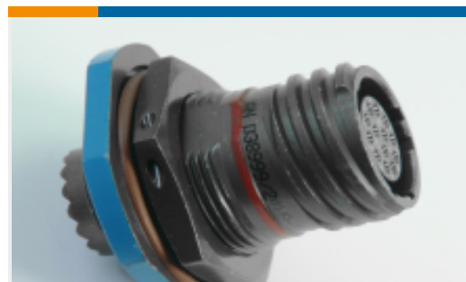
TE Part #YDTS24W19-32SNV001 RECP ASSY