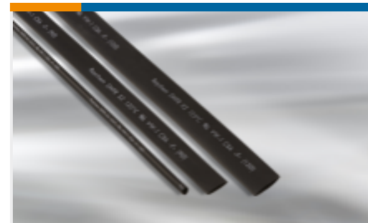
TE Part #EM7489-000 X2-8.0-0-FSP-SM