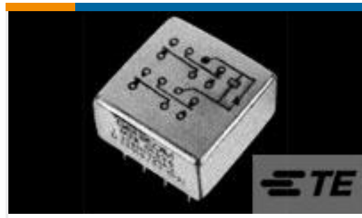
TE Part #1617086-6 3SBM1071A2 = M39016/31-003M