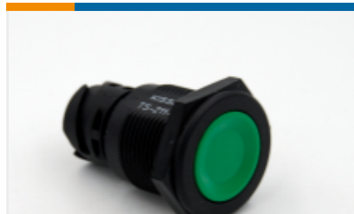
TE Part #K1153931 Push Button Switch, Center Thread, 1 Actuator, Flush Profile