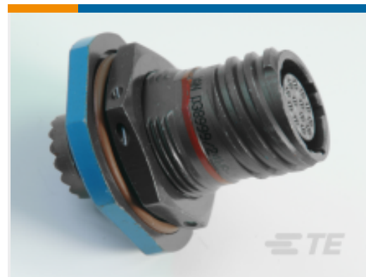
TE Part # CAT-D38999-DTS15B Jam Nut: D38999, 13-98 Insert