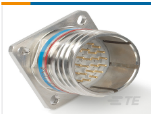
TE Part # CAT-D38999-DTS6J D38999: Square Flange, 13-98 insert