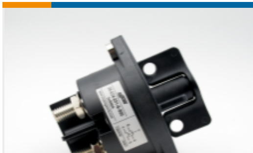
TE Part #K1156392 Battery Disconnecter 35-524-231-R-A-906