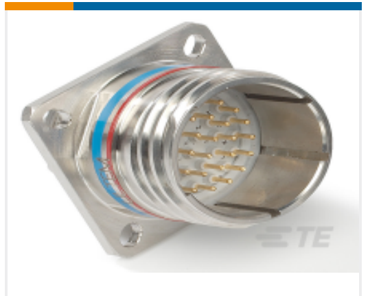
TE Part #YDTS20W17-26SNV001 RECP ASSY