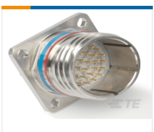
TE Part #YDTS20W09-35PNV001 RECP ASSY