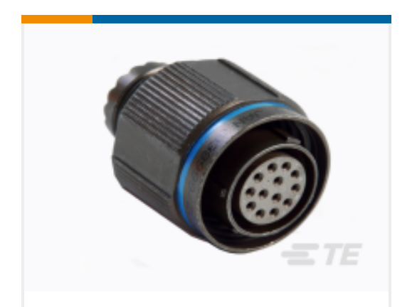
TE Part #YDTS26W15-35PNV001 PLUG ASSY