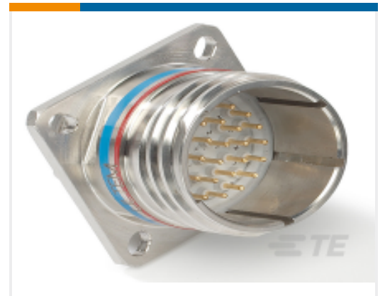
TE Part #YDTS20W21-35SNV001 RECP ASSY