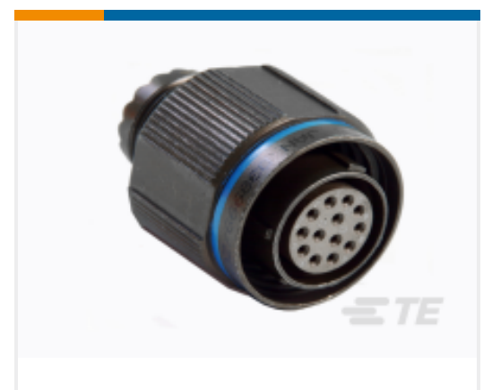
TE Part #YDTS26W09-35SNV001 PLUG ASSY