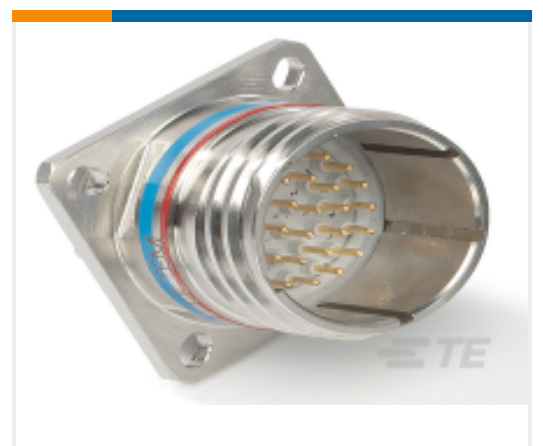
TE Part #YDTS20W17-35SBV001 RECP ASSY