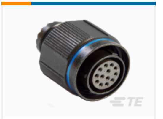
TE Part #YDTS26W11-35PNV001 PLUG ASSY