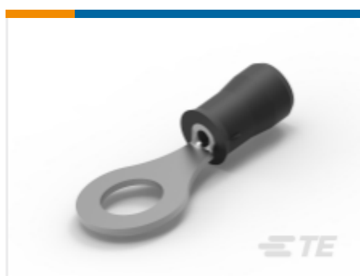
TE Part #320563 PIDG Ring Tongue Terminals