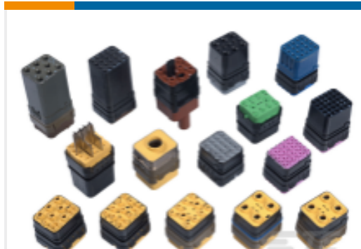
TE Part #ZPF000000000015306 DMC-M 20-22 PN