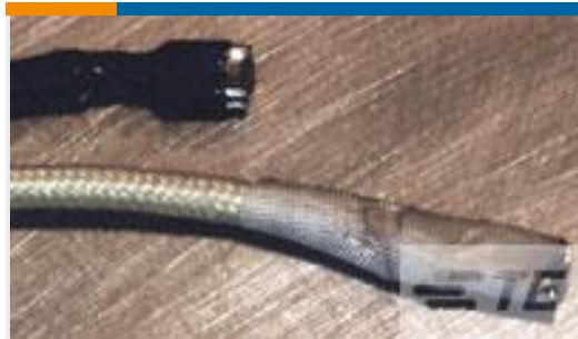
TE Part #8623434002 RT555-5/8-0-SP