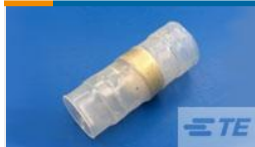
TE Part #690886-000 B-050-00