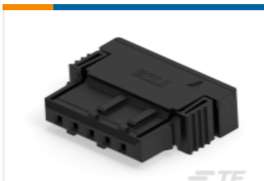
TE Part #364226-E SRCBUG A 2,54 2 5 CSI 112 E1 ADV J 2 324