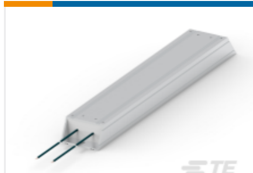
TE Part #2176466-7 HCH335 500W 100R 5% LEAD