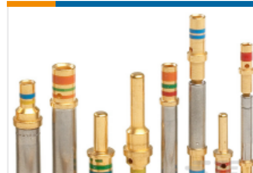
TE Part #ZPF000000000000570 020-0511-20