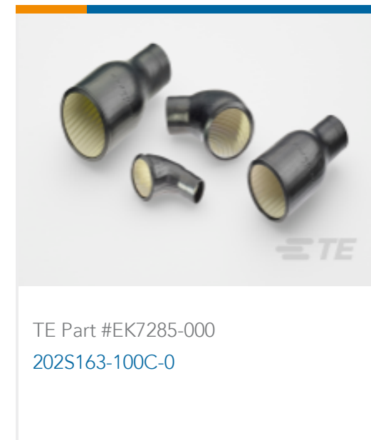
TE Part #EK7285-000 202S163-100C-0