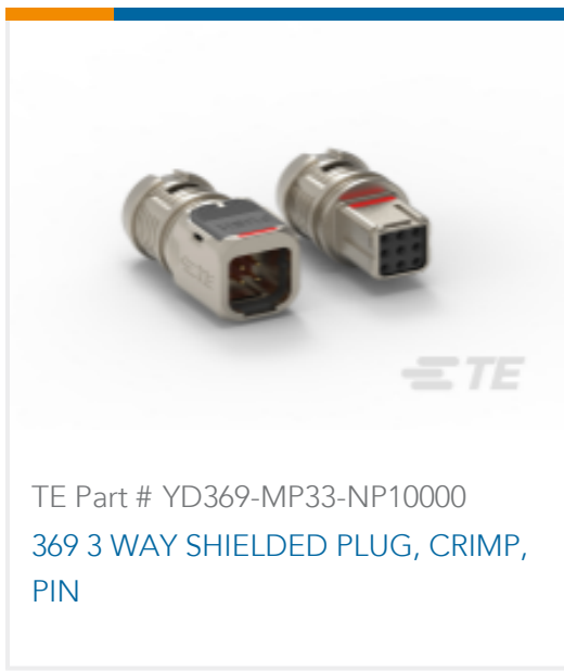
TE Part # YD369-MP33-NP10000 369 3 WAY SHIELDED PLUG, CRIMP, PIN