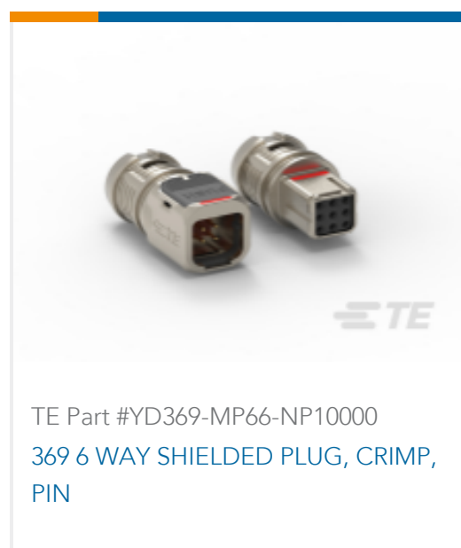
TE Part #YD369-MP66-NP10000 369 6 WAY SHIELDED PLUG, CRIMP, PIN