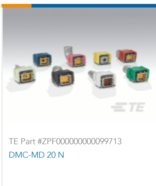
TE Part #ZPF000000000099713 DMC-MD 20 N