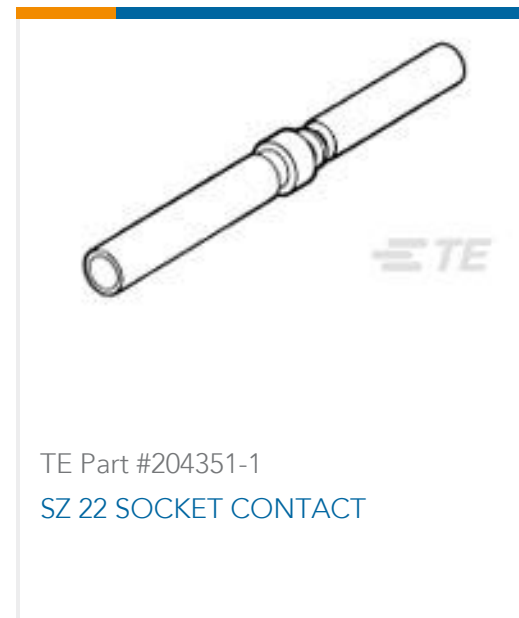
TE Part #204351-1 SZ 22 SOCKET CONTACT