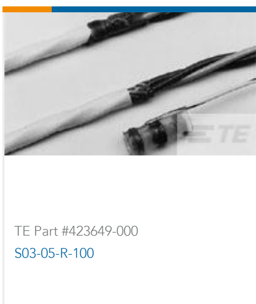
TE Part #423649-000 S03-05-R-100