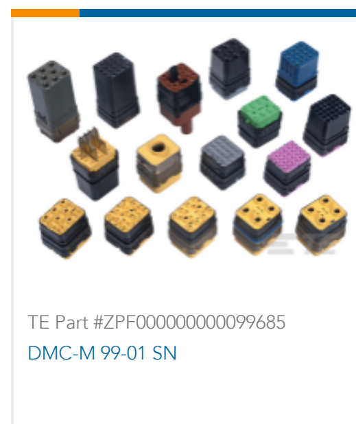
TE Part #ZPF000000000099685 DMC-M 99-01 SN