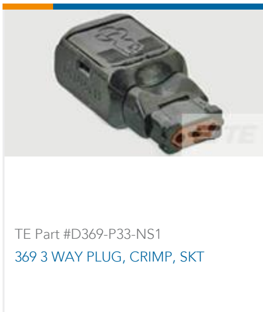
TE Part #D369-P33-NS1 369 3 WAY PLUG, CRIMP, SKT