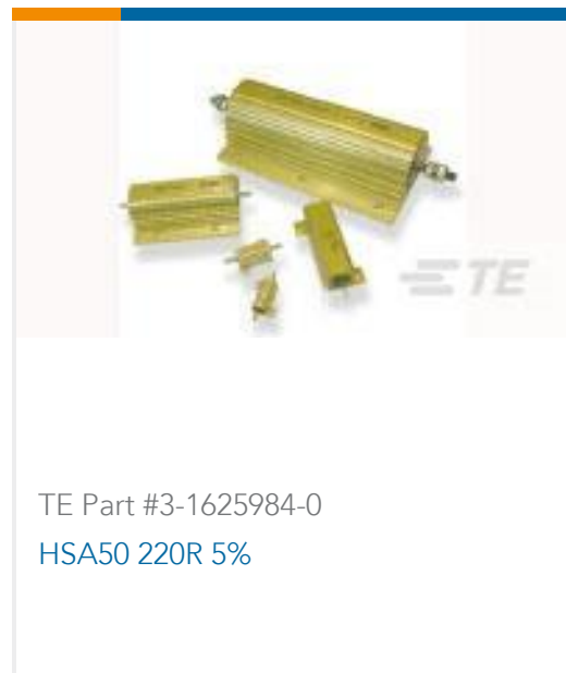
TE Part #3-1625984-0 HSA50 220R 5%