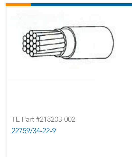
TE Part #218203-002 22759/34-22-9