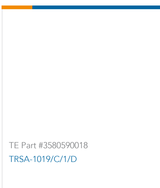
TE Part #3580590018 TRSA-1019/C/1/D