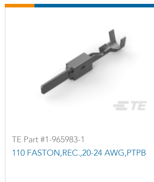
TE Part #1-965983-1 110 FASTON,REC.,20-24 AWG,PTPB