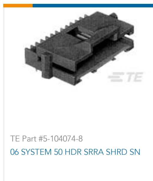
TE Part #5-104074-8 06 SYSTEM 50 HDR SRRRA SHRD SN