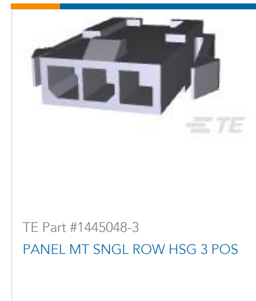
TE Part #1445048-3 PANEL MT SNGL ROW HSG 3 POS