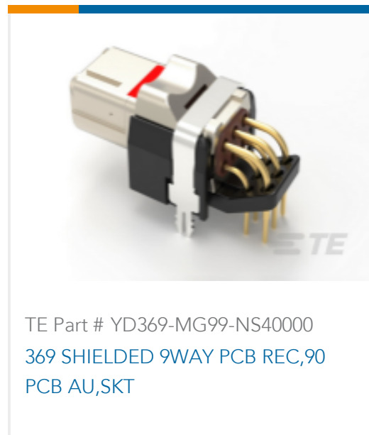
TE Part # YD369-MG99-NS40000 369 SHIELDED 9WAY PCB REC,90 PCB AU,SKT