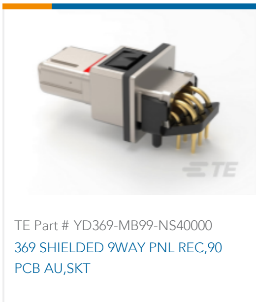
TE Part # YD369-MB99-NS40000 369 SHIELDED 9WAY PNL REC,90 PCB AU,SKT