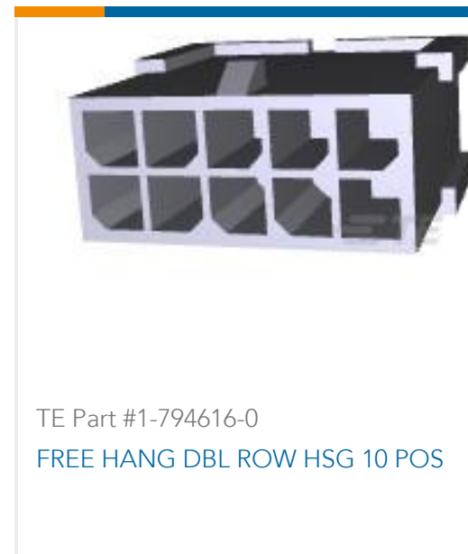
TE Part #1-794616-0 FREE HANG DBL ROW HSG 10 POS