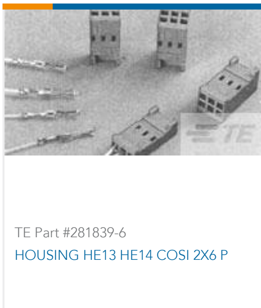
TE Part #281839-6 HOUSING HE13 HE14 COSI 2X6 P