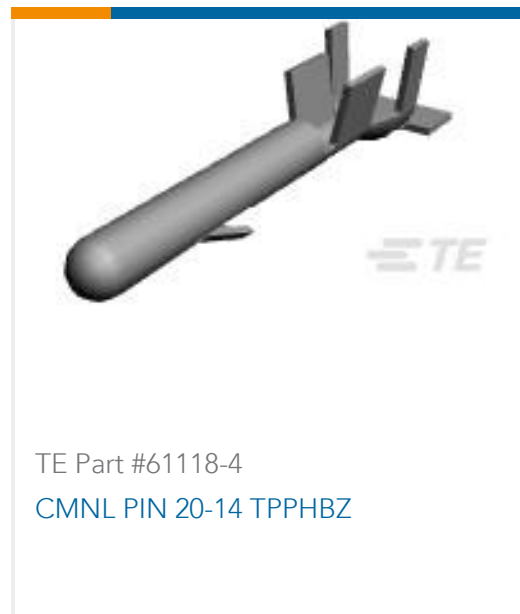
TE Part #61118-4 CMNL PIN 20-14 TPPHBZ