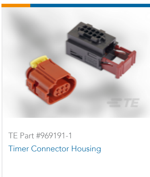
TE Part #969191-1 Timer Connector Housing