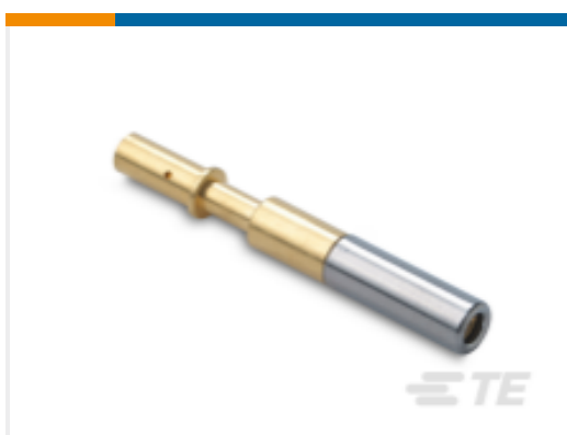
TE Part #Y5015-000000100118 SIZE 12 SOCKET CONTACT