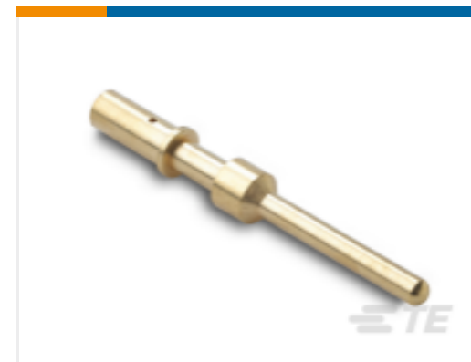
TE Part #Y5015-000000100116 SIZE 12 PIN CONTACT