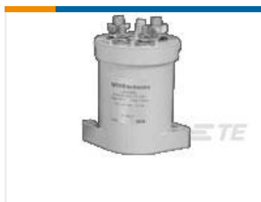
TE Part #4-1618388-6 LEV200A5NAA=RELAY, SPST-NO