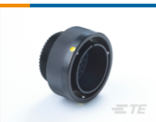
TE Part #Y5015-000000100031 FREE PIN CONNECTOR