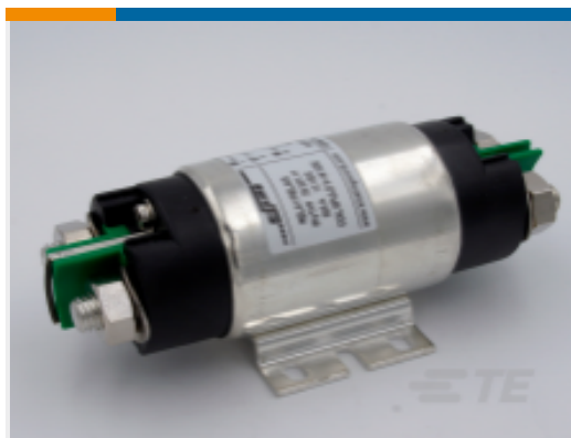
TE Part #K1013120 Relay 29-321-12