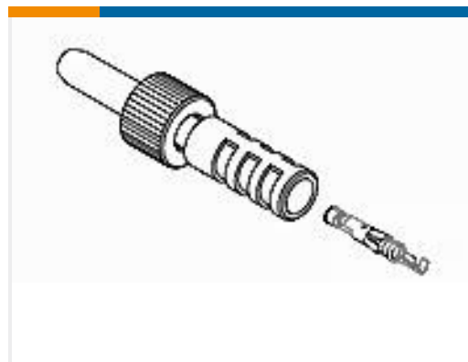
TE Part #5-861610-3 LGH, HIGH VOLTAGE PLUG