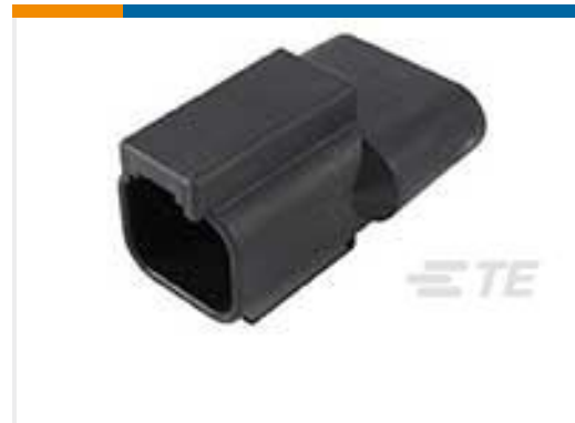
TE Part #DT04-2P-RT21 REC, 2P, BLK, 511 OHM RESISTOR, NI