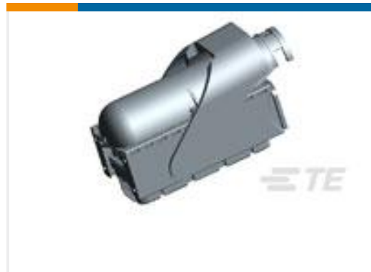
TE Part #9-1534904-4 CONNECTOR HSG 94 POS.