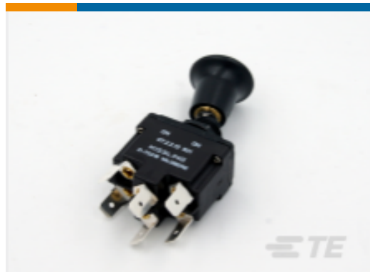
TE Part #K1132223 Toggle Switch 07-2-2-15 A 905