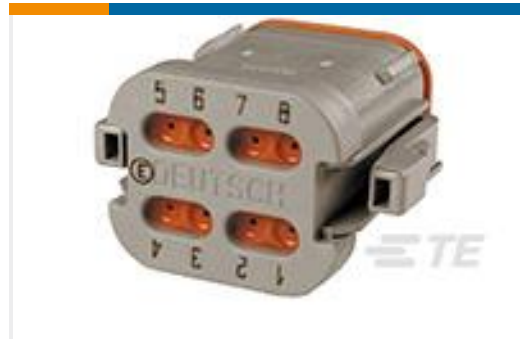
TE Part #DT06-08SA-CE05 PLG, 8P, GRY, E, SEAL RET, CAP, A