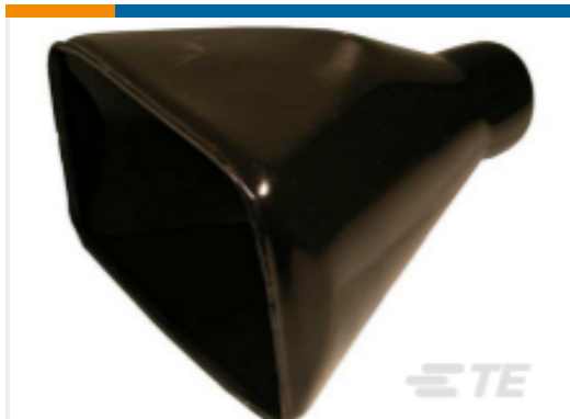
TE Part #DRB102-BT BOOT, 102P, PLG/REC, ST, BLK