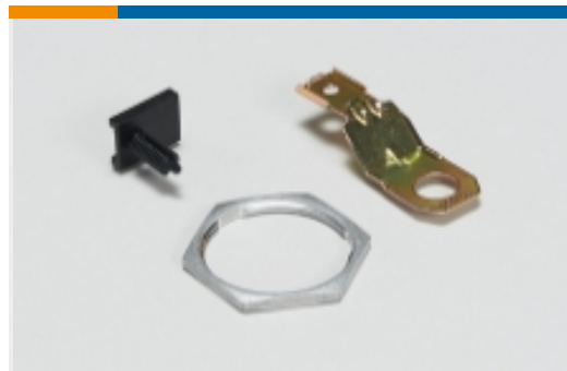
Other Automotive Connector Accessories(6)