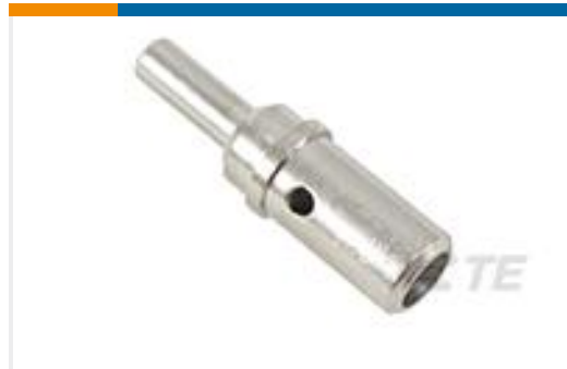
TE Part #0460-204-08141 PIN, SOLID, SIZE 8, 8-10AWG, NI