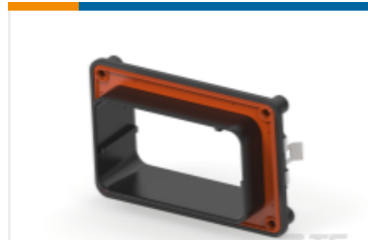
TE Part #DRBF-1B FLANGE, MOUNT, 102/128P, BLK, B