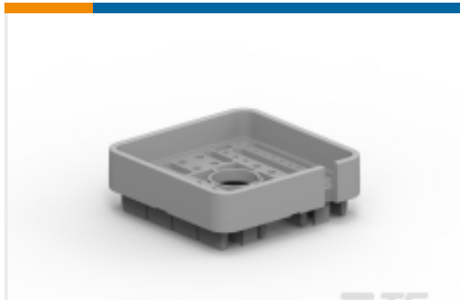
TE Part #WB-60SA DEUTSCH DRB Wedgelocks