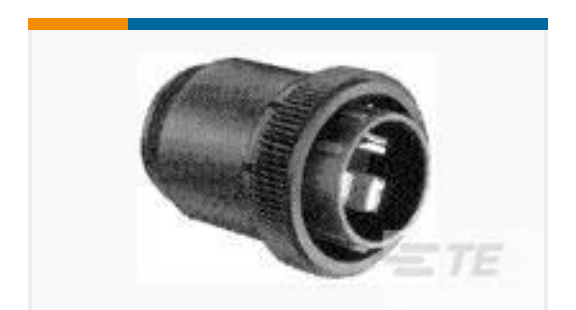
TE Part #206426-1 CPC PLUG ASSEMBLY SIZE 17-3