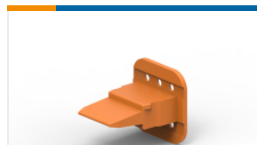
TE Part #W6S WEDGE LOCK, 6P, PLG, ORG, STD, DT