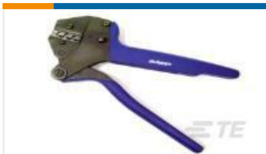
TE Part #539635-1 ERGO HAND TOOL FRAME W/O DIES