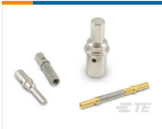
TE Part #0462-209-16141 DEUTSCH Solid Contacts