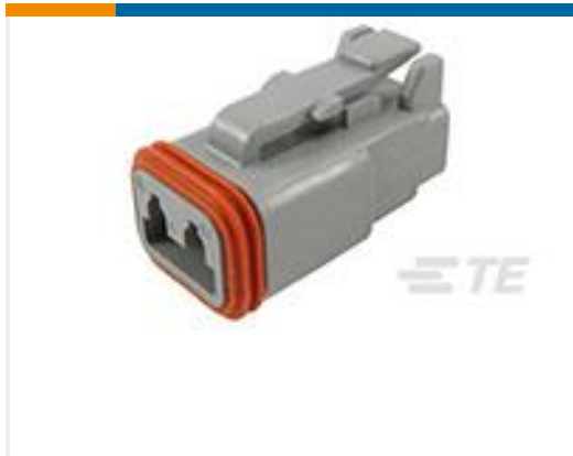
TE Part #DT06-2S-C015 PLG, 2P, GRY, E