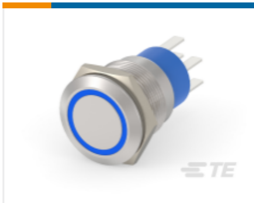
TE Part #5-2213767-7 AV19 DPM 5A MOVE RING LED BLUE 12V