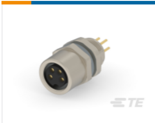
TE Part #T4043014041-000 M8.FMLE.PNLFRONT.4POS.STRPCB