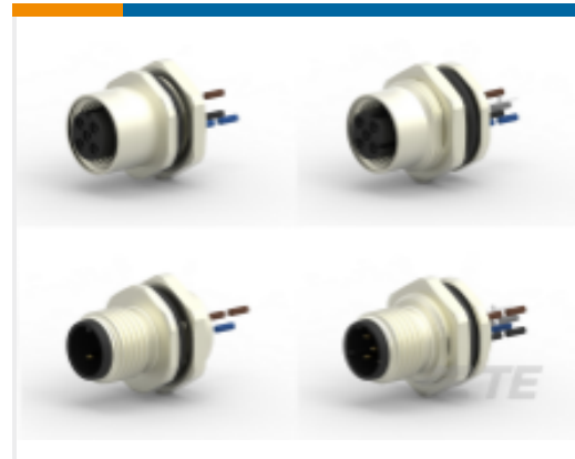
TE Part #T4171220008-001 M12 Panel Mount Wire