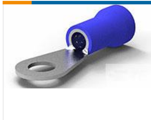
TE Part #52264-4 TERMINAL R PG 6 5/16