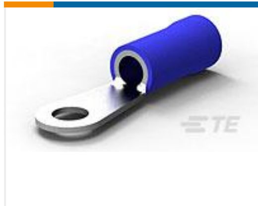
TE Part #52042-7 TERMINAL R PG 6 1/4