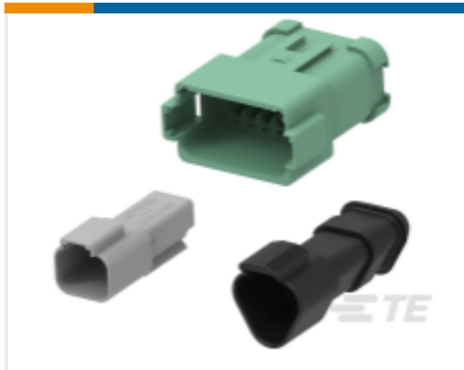
TE Part #DT04-3P DEUTSCH DT Receptacle Connectors