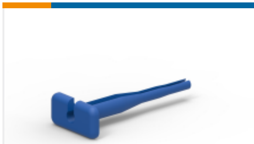
TE Part #0411-310-1605 EXT TOOL, SIZE 16, 16-18 AWG, T, LT BLU