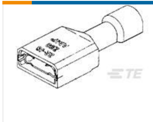
TE Part #2-520401-2 ULTRA-FAST 187 ASY REC 22-18 TPBR