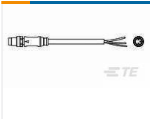
TE Part #1-2273000-1 M8 x 1.0 straight plug Pigtail