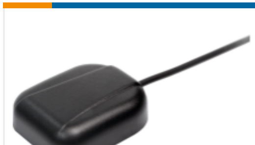
TE Part #ANT-GPS-SH2-SMA Antenna GPS Ext Mag RG174 3M SMA