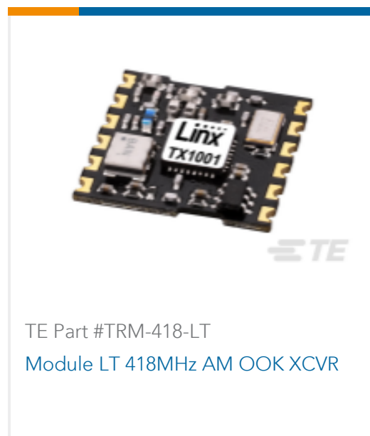
TE Part #TRM-418-LT Module LT 418MHz AM OOK XCVR