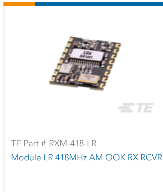
TE Part # RXM-418-LR Module LR 418MHz AM OOK RX RCVR