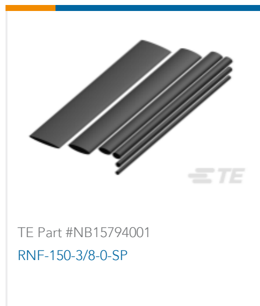
TE Part #NB15794001 RNF-150-3/8-0-SP