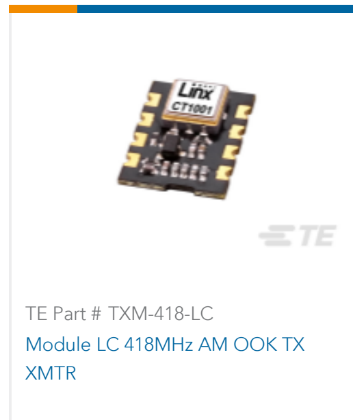
TE Part # TXM-418-LC Module LC 418MHz AM OOK TX XMTR