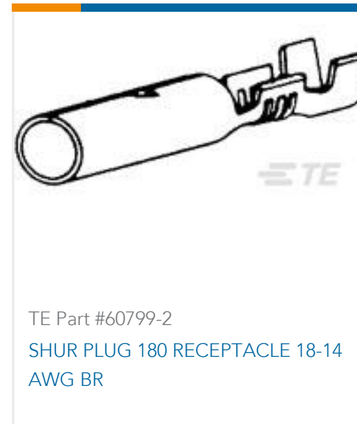
TE Part #60799-2 SHUR PLUG 180 RECEPTACLE 18-14 AWG BR