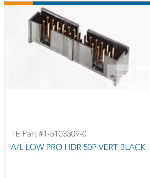
TE Part #1-5103309-0 A/L LOW PRO HDR 50P VERT BLACK