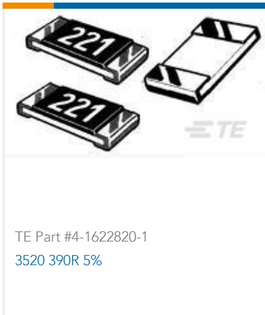
TE Part #4-1622820-1 3520 390R 5%