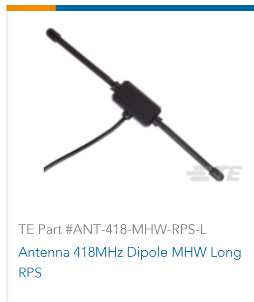
TE Part #ANT-418-MHW-RPS-L Antenna 418MHz Dipole MHW Long RPS