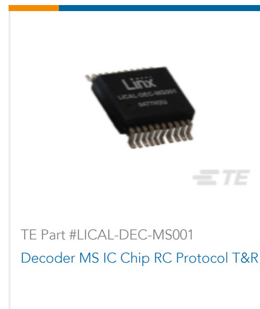
TE Part #LICAL-DEC-MS001 Decoder MS IC Chip RC Protocol T&R RPS