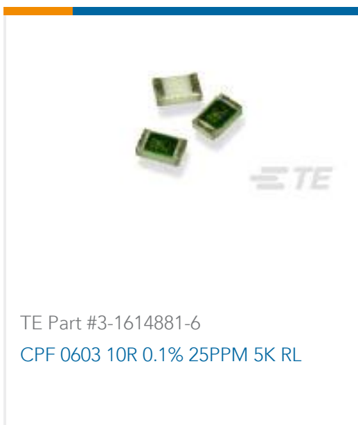
TE Part #3-1614881-6 CPF 0603 10R 0.1% 25PPM 5K RL