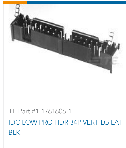
TE Part #1-1761606-1 IDC LOW PRO HDR 34P VERT LG LAT BLK