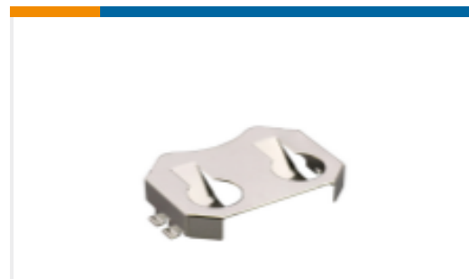
TE Part #BAT-HLD-001 Battery Holder Coin 2032 SMT Nickel Bulk