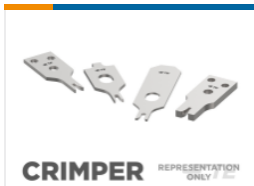
TE Part #1803697-2 CRIMPER, WIRE PREMIUM, STEPPED