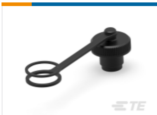
TE Part #2823065-1 M12-DUST CAP-FEMALE CONN-IP67-WIT SLEEVE