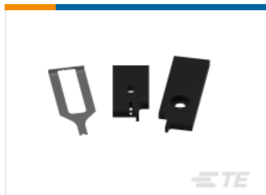
TE Part #1-1722368-8 SPRING, DEPRESSOR WIRE