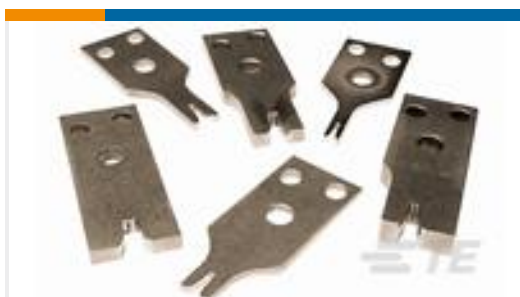
TE Part #5-654223-8 DRAHTCRIMPER