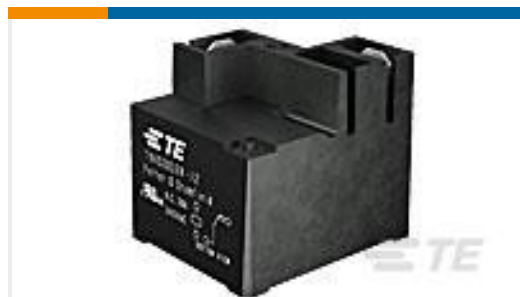
TE Part #5-1419102-8 T9AP1D52-48