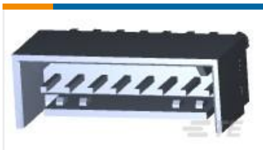
TE Part #2-644486-8 08P MTA100 SHRDED HDR ASSY SN