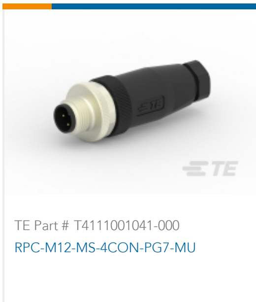
TE Part # T4111001041-000 RPC-M12-MS-4CON-PG7-MU