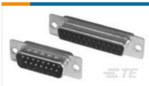
TE Part #5-747904-5 9 Plug Solder Cup, 30 gold, Ro