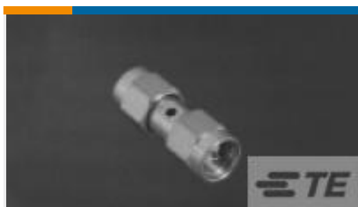
TE Part #1056336-1 SMA Plug to Plug Adapter 2781 0000 02