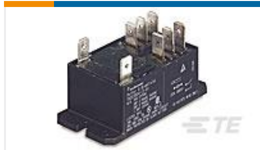
TE Part #1-1393212-0 T92S7D12-24