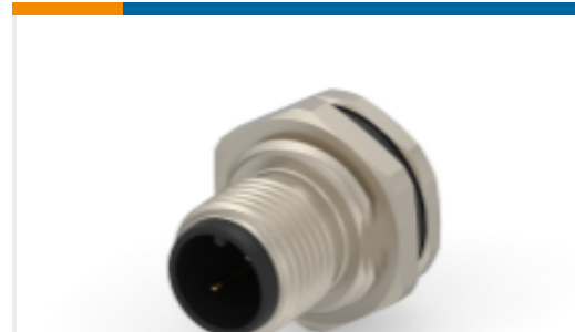
TE Part #T4171010002-001 M12, REAR MOUNTING, MALE, A, 2P, 0.2 M WIRE