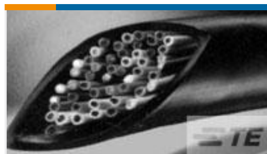
TE Part #C96433-000 NT-MIL-1/4-0-SP