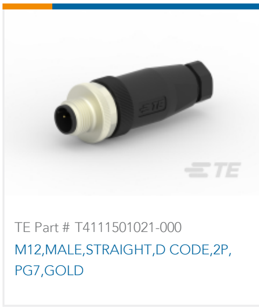
TE Part # T4111501021-000 M12, MALE, STRAIGHT, D CODE, 2P, PG7, GOLD