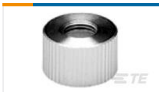
TE Part #8-1437627-2 G12B=BUTTON GUARD BLACK