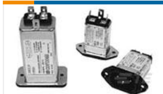
TE Part #6609006-5 3EEJ1=F8009 S0