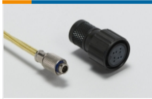
Standard Circular Connectors(521)