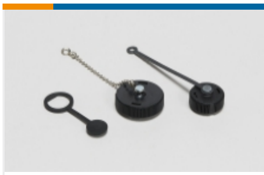
Circular Connector Caps & Covers(2)