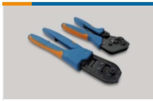
Hand Crimping Tools(32)