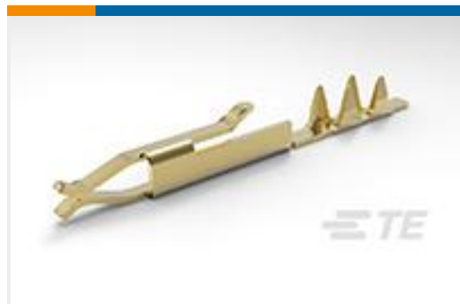
TE Part #1-487547-1 FFC,RCPT CONTACT,.050" CNTRLIN