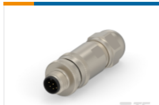
TE Part #T4111012081-000 M12 M, 8P GOLD A_CODE S SHIELDED PG9