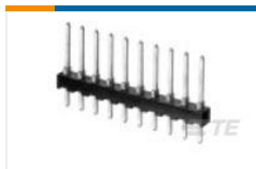
TE Part #87220-8 08 MODII HDR SRST UNSHRD .100