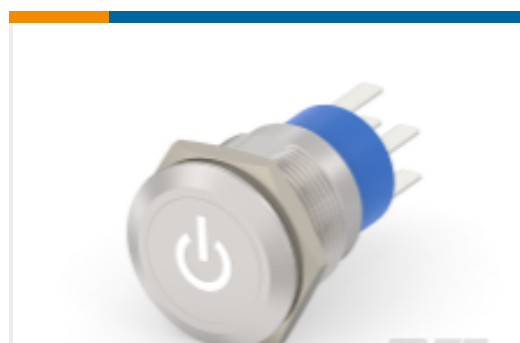
TE Part #6-2213766-3 AV19 DPL 5A POWER LED WHITE 24V