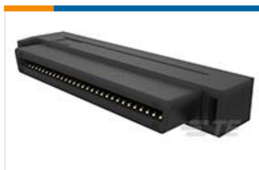
TE Part #1734098-4 Champ050 40p A/P RCPT 25CL PB