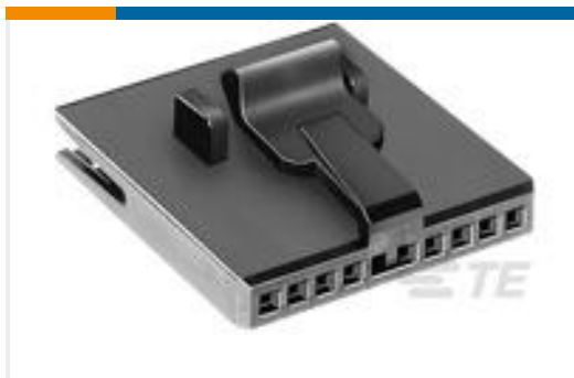
TE Part #1-487545-7 020 HOUSING FFC RCPT 050CL SR