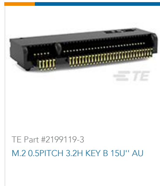
TE Part #2199119-3 M.2 0.5PITCH 3.2H KEY B 15U" AU