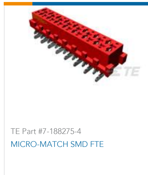
TE Part #7-188275-4 MICRO-MATCH SMD FTE