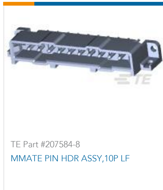
TE Part #207584-8 MMATE PIN HDR ASSY,10P LF