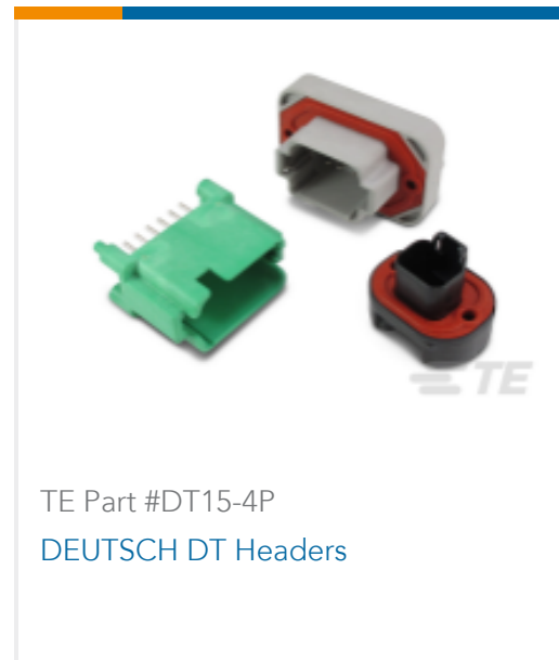
TE Part #DT15-4P DEUTSCH DT Headers