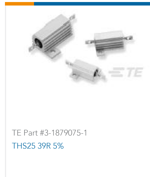
TE Part #3-1879075-1 THS25 39R 5%