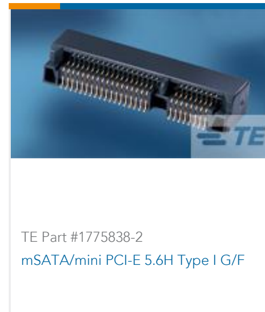
TE Part #1775838-2 mSATA/mini PCI-E 5.6H Type I G/F