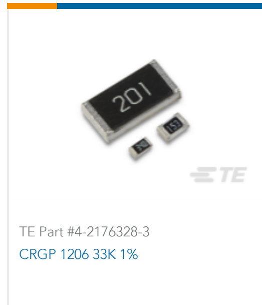
TE Part #4-2176328-3 CRGP 1206 33K 1%