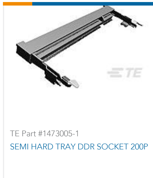
TE Part #1473005-1 SEMI HARD TRAY DDR SOCKET 200P