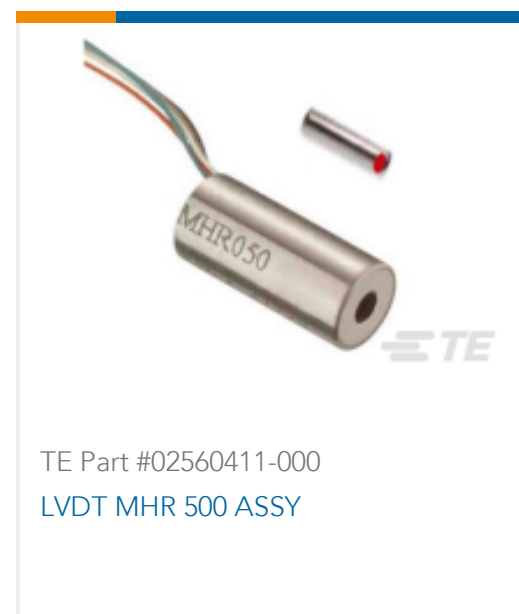
TE Part #02560411-000 LVDT MHR 500 ASSY