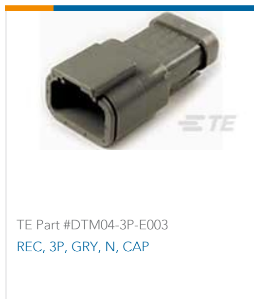
TE Part #DTM04-3P-E003 REC, 3P, GRY, N, CAP