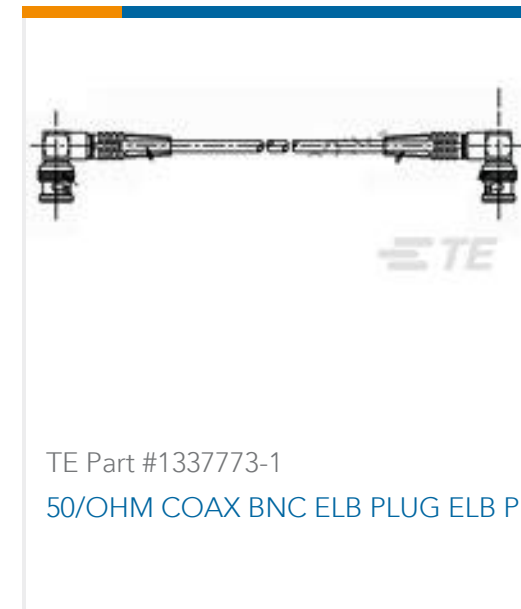
TE Part #1337773-1 50/OHM COAX BNC ELB PLUG ELB P RED