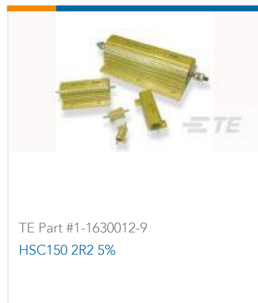
TE Part #1-1630012-9 HSC150 2R2 5%