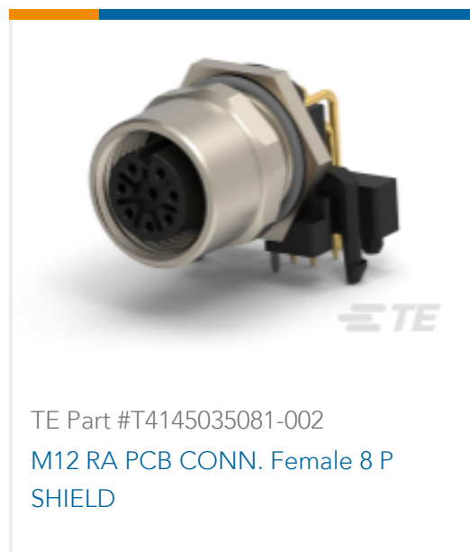
TE Part #T4145035081-002 M12 RA PCB CONN. Female 8 P SHIELD