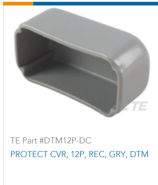
TE Part #DTM12P-DC PROTECT CVR, 12P, REC, GRY, DTM