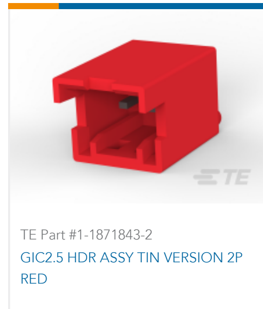
TE Part #1-1871843-2 GIC2.5 HDR ASSY TIN VERSION 2P RED