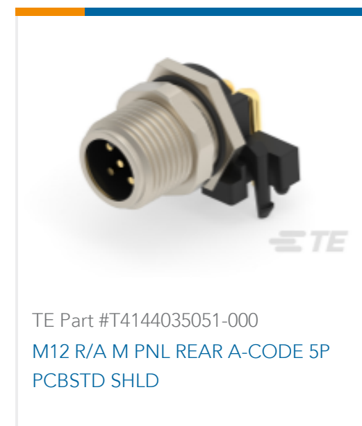
TE Part #T4144035051-000 M12 R/A M PNL REAR A-CODE 5P PCBSTD SHLD