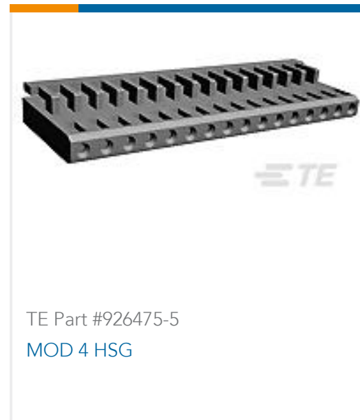
TE Part #926475-5 MOD 4 HSG