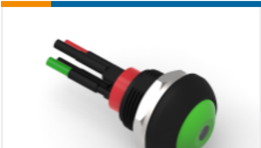
TE Part #1-2329389-7 PB OFF/ON FC GRE M1 TERM RED LED IP68 50