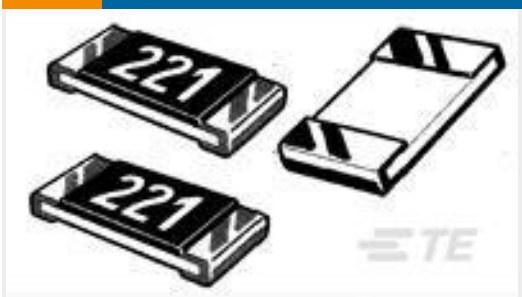
TE Part #3-2176230-4 3522 470R 5% 3W