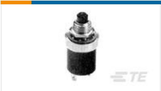
TE Part #1825516-1 MSP103B04