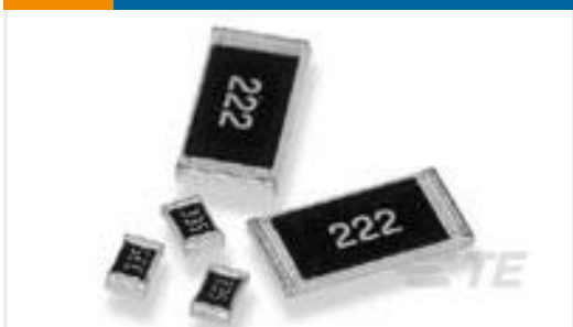
TE Part #1623404-1 CRG1206 1% 10K