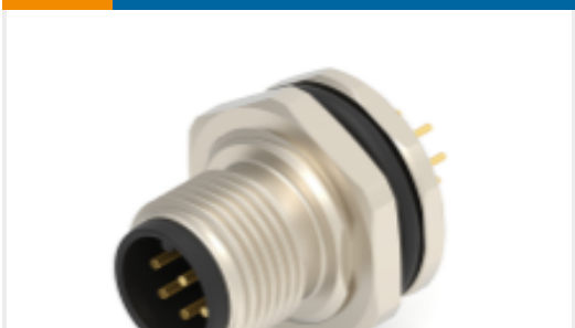
TE Part #T4140012081-000 M12,REAR MOUNT,MALE,A,8P, SOLDER PCB