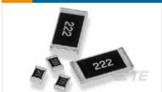
TE Part #1623693-1 CRG1206 ZEROHM