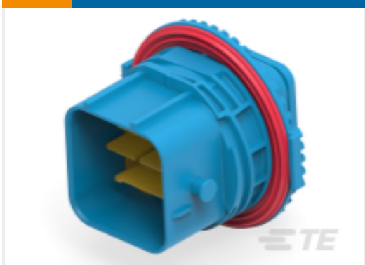
TE Part #2-2366509-4 48POS,HYBRID,PIN HSG ASSY,SLD, COD D