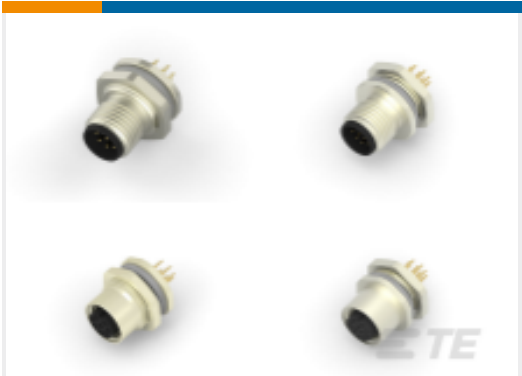
TE Part #T4141012051-000 M12 Panel Mount PCB