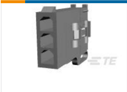
TE Part #794187-1 03P MINI UMNL2 CAP HSG UL94V0