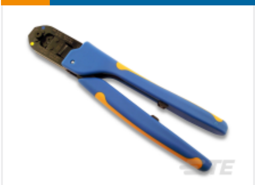
TE Part #2217748-1 CCII AMPSEAL CONT 20-16 ASSY