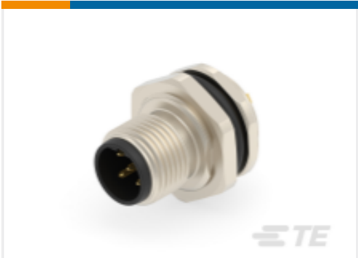
TE Part #T4130412051-000 M12,REAR MOUNT,MALE,B,5P, SOLDER WIRE