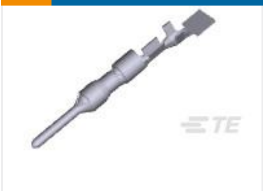
TE Part #1-794224-0 MINI UMNL2 PIN 30-26AWG LP LF