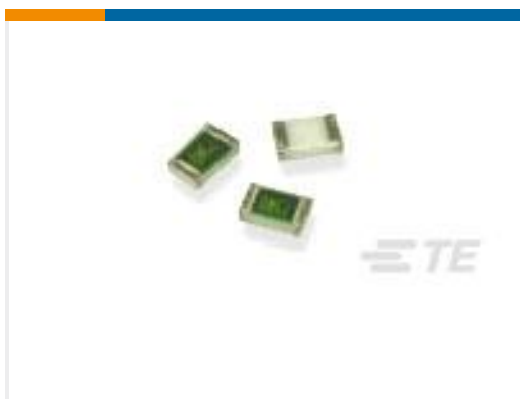
TE Part #1676703-2 RN 0805 49R9 0.1% 10PPM 1K RL