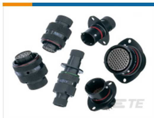
TE Part #AS608-35SN-903M PLUG BOOT TERMINN (903M)