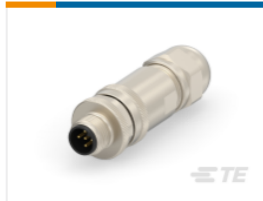
TE Part #T4111012051-000 M12 M, 5P GOLD A_CODE S SHIELDED PG9