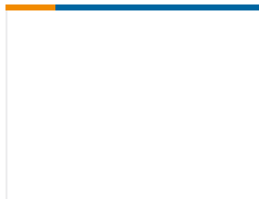
TE Part #374Z-05341 Speed sen DSY 1205.02 SHW 3785189