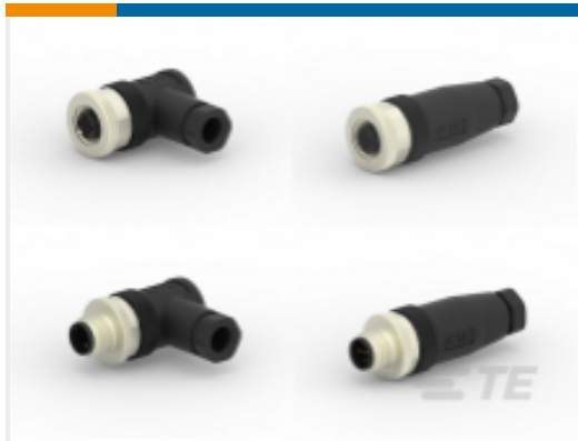
TE Part #T4110002051-000 M12 Field Installable Unshielded