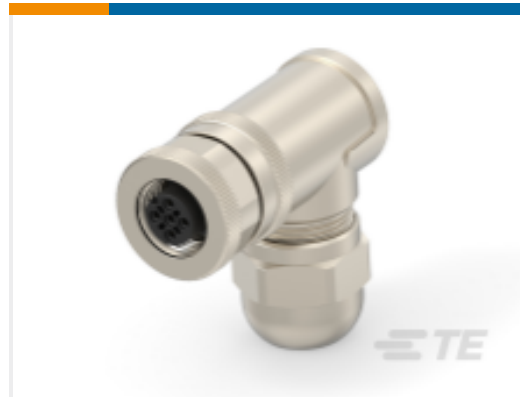
TE Part #T4112012051-000 M12 F, 5P GOLD A_CODE RA SHIELDED PG9