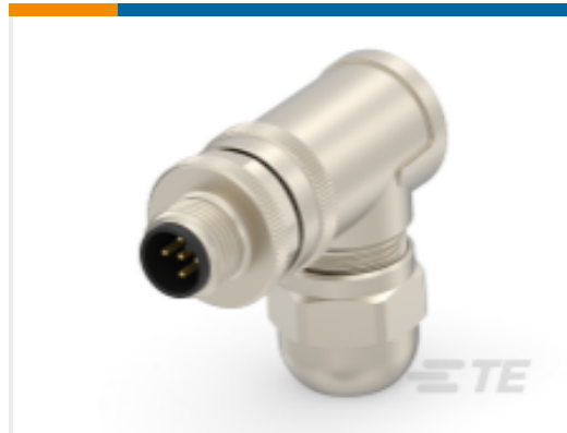
TE Part #T4113012051-000 M12 M, 5P GOLD A_CODE RA SHIELDED PG9