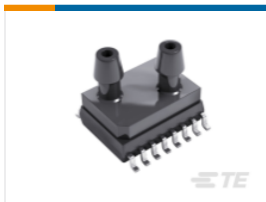
TE Part #9233-BCE-S-250-000 250PA DIFF. DIGITAL PRESSURE SENSOR