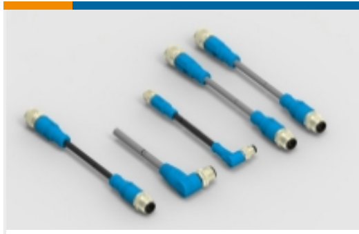
M8/M12 Cable Assemblies(147)