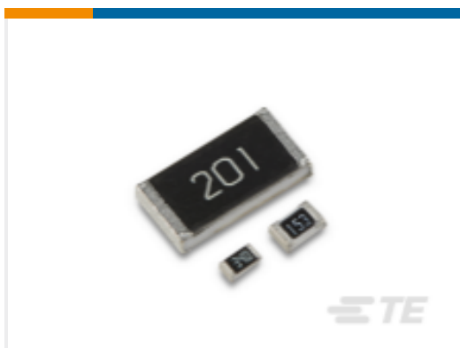
TE Part #2-2176328-7 CRGP 1206 1K5 1%