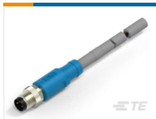
TE Part #T4061120003-005 M8 CABLE ST M 5M 3POS PUR CABLE