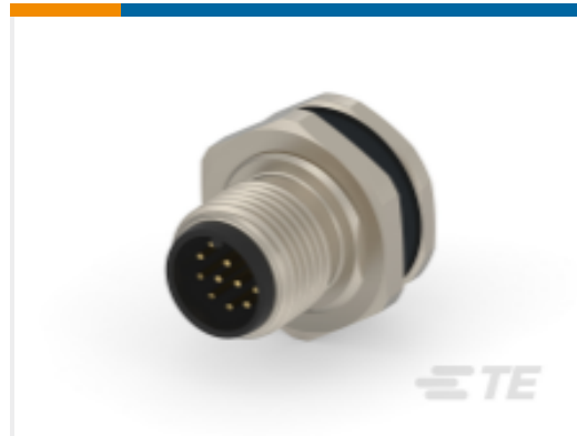
TE Part #T4171030012-001 M12,REAR MOUNT,MALE, A, 12P, 0.2 M WIRE