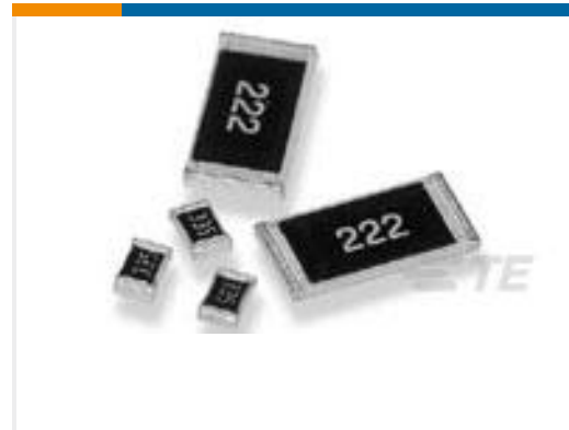
TE Part #2-1676480-2 CRG0402 1% 1K0