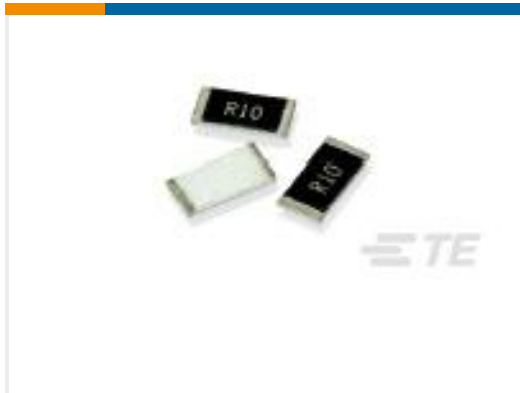
TE Part #1-2176056-9 RLP73N 2B R056 5% 5K RL