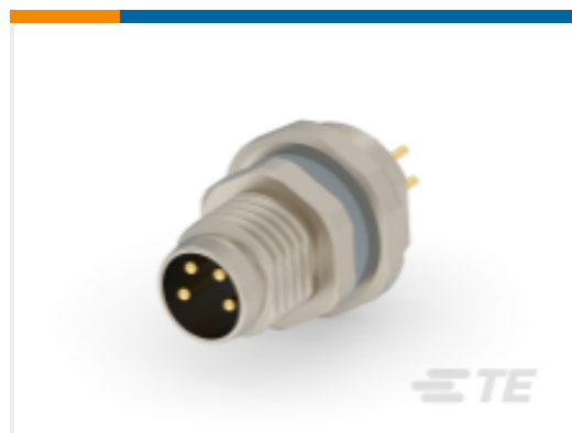
TE Part #T4040014041-000 M8.MLE.PNLREAR.4POS.STR PCB