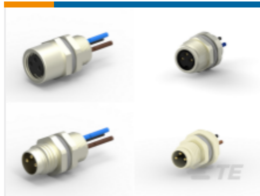
TE Part #T4070014041-001 M8 Panel Mount Wire