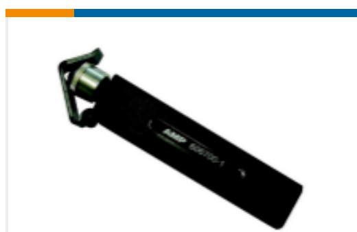
TE Part #606701-1 BLADE FOR 606700-1 (2/BAG)