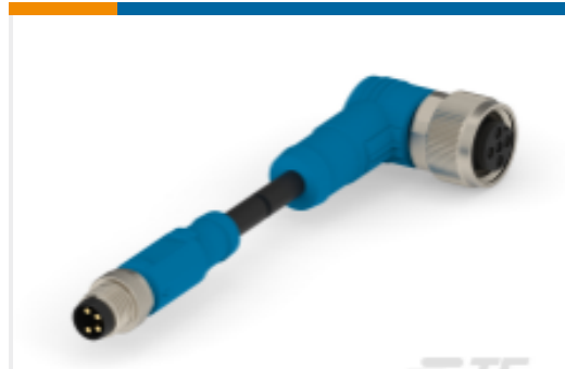
TE Part #T4052118004-001 RPC-M8-4MS-0.5-M12-4FR-PVC