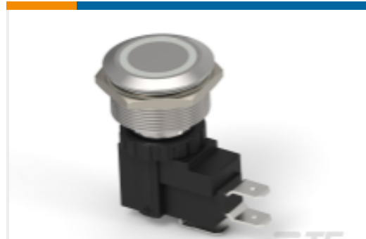
TE Part #2364699-2 AVH25 FLT SS LK NO LED 26A