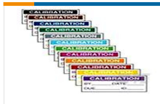
TE Part #1878647-3 MQC555GR