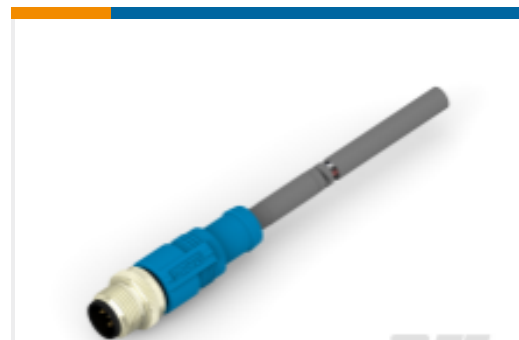
TE Part #T4161120005-001 RPC-M12-MS-5CON-PUR-0.5SH