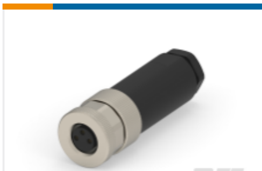
TE Part #T4010008031-000 M8,SCREW, FEMALE,S,UNSHIELD,3P, GOLD