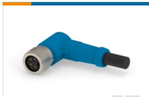
TE Part #T4061410004-004 M8 CABLE RA FEMALE 3M 4POS PVC CABLE