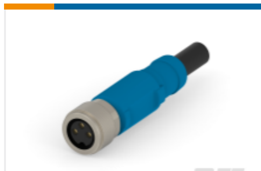
TE Part #T4061310003-001 M8 CABLE ST FEMALE 0.5M 3POS PVC CABLE