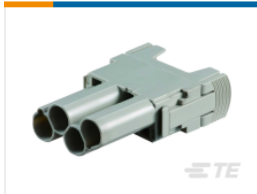
TE Part #T2111042101-000 HMN-004-M