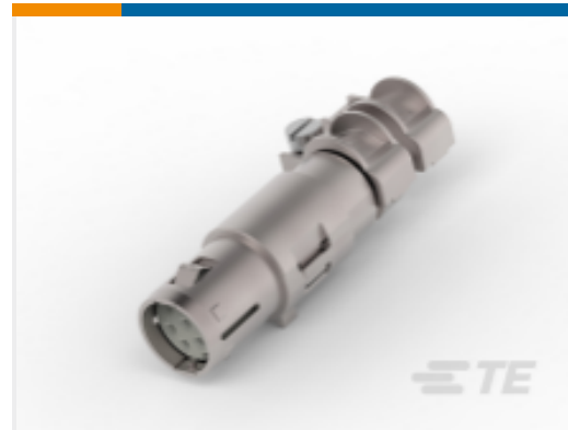
TE Part #T2580082154-000 PIN-Q3-F