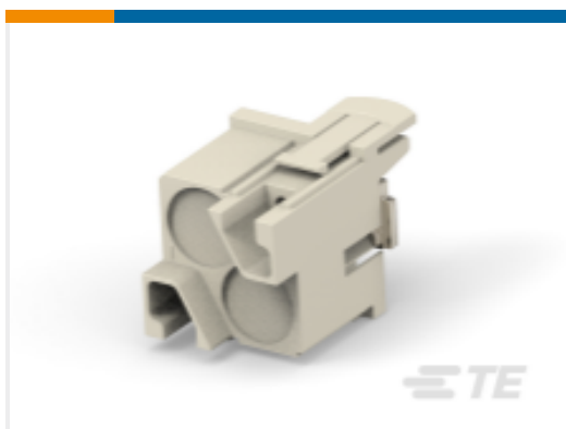
TE Part #T2111027101-101 HMN-Q2-M