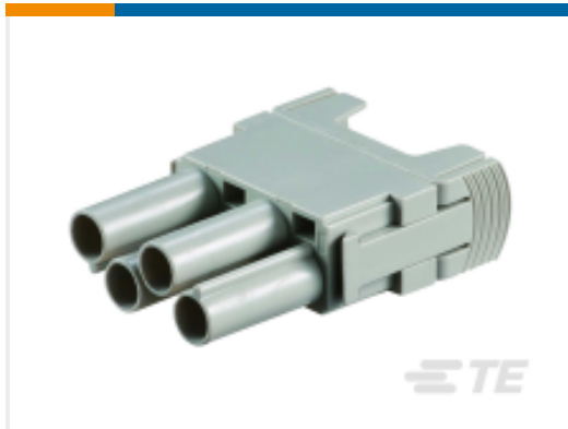
TE Part #T2111042201-000 HMN-004-F