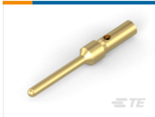
TE Part #T2070011013-000 DAM-13