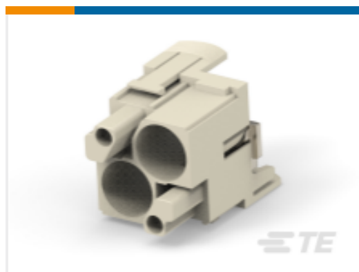
TE Part #T2111027201-101 HMN-Q2-F