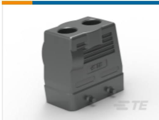
TE Part #T1240100216-000 H10B-TGH-2PG16