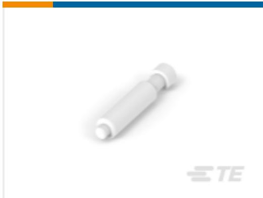
TE Part #T0931004524-000 CODING-PIN-HQ/HE