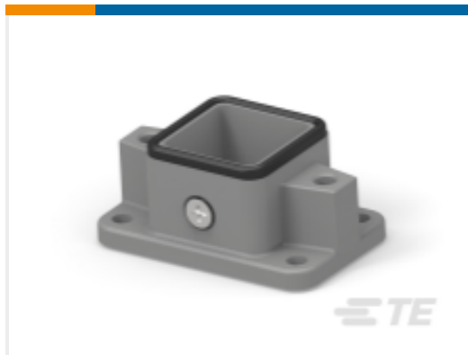
TE Part #T1936030000-000 H3APR-AGC