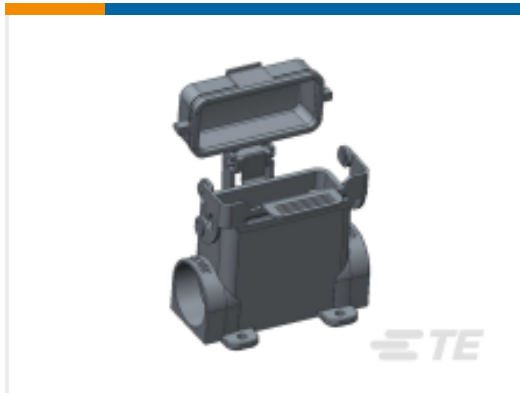
TE Part #T1629101120-000 H10A-SDRMS-M20