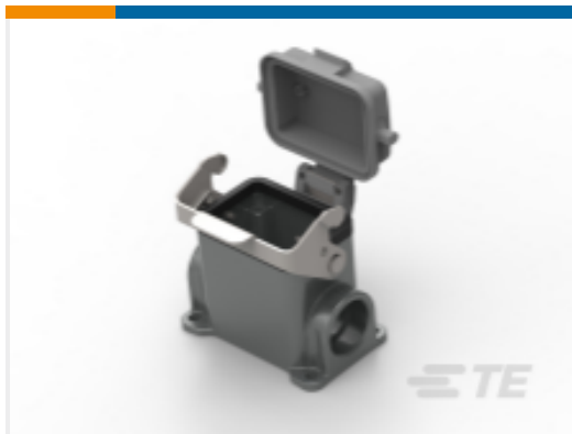
TE Part #T1620063125-000 H6B-SDR-M25