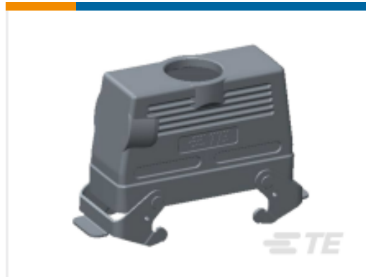
TE Part #T1280242129-000 H24B-TGBH-PG29