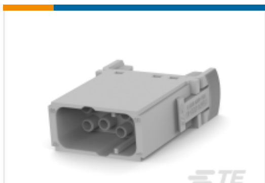
TE Part #T2111082101-000 HMN-008-M