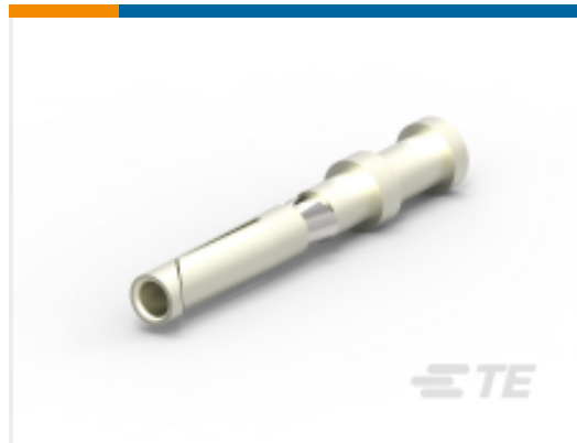
TE Part #T2020002002-000 CDF-0.3