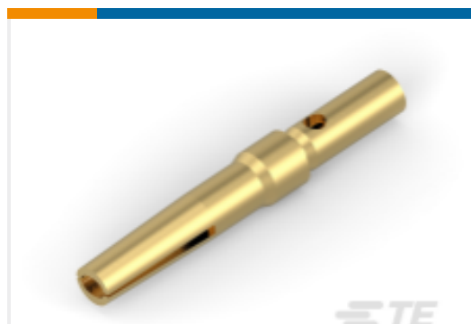
TE Part #T2070012013-000 DAF-13