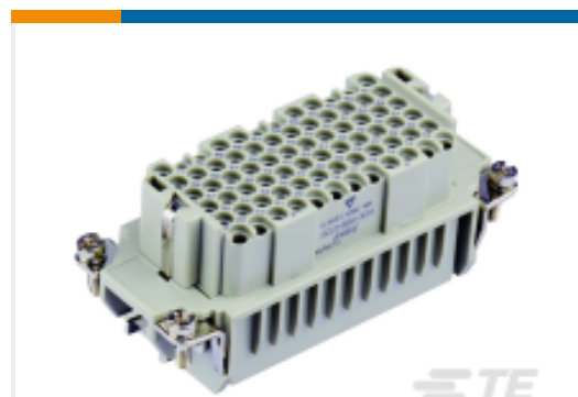
TE Part #T2030722201-000 HDD-072-F