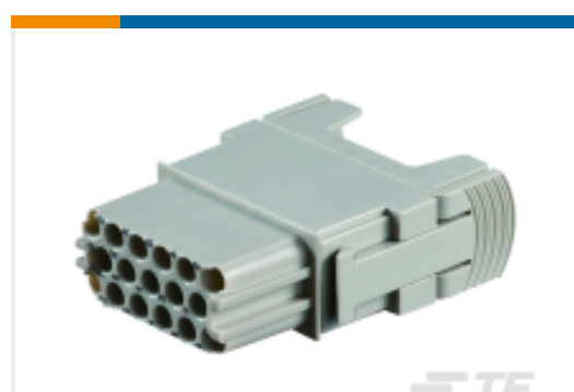
TE Part #T2111172201-000 HMN-017-F