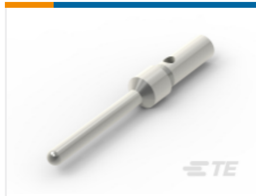
TE Part #T2070001033-000 CAM-33