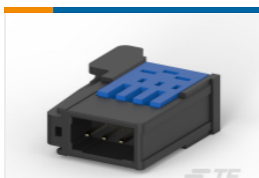
TE Part #2-2295044-3 RITS CONN. PLUG ASSY 3P BLUE TIN