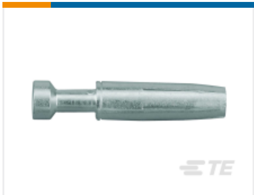
TE Part #T2030002002-000 CEF-0.3