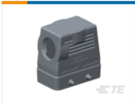
TE Part #T1230100121-000 H10B-TSH-PG21