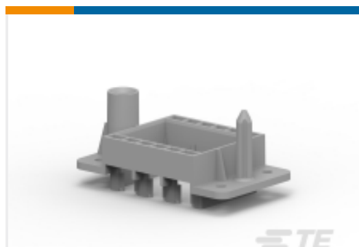
TE Part #T2071104201-000 H10BP-T3-F DOCKING FRAME_FIXED