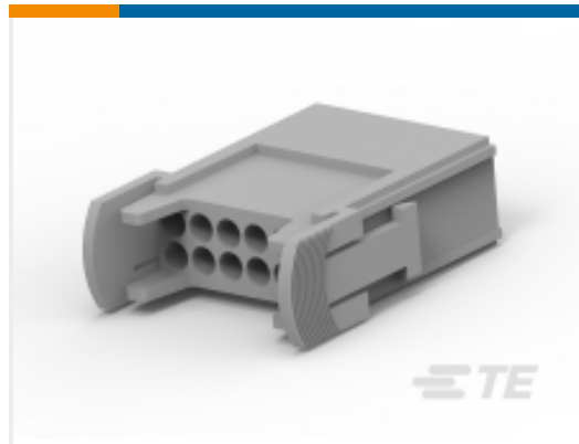
TE Part #T2111122101-000 HMN-012-M