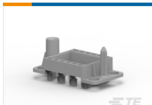
TE Part #T2071104101-000 H10BP-T3-M DOCKING FRAME_FLOATING