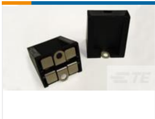
TE Part #1643903-1 CROWN CLIP Senior II 538-0068-00100