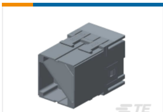
TE Part #T2111028101-000 HMN-D2-MC