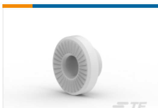
TE Part #T0930050457-000 FLOATING WASHER