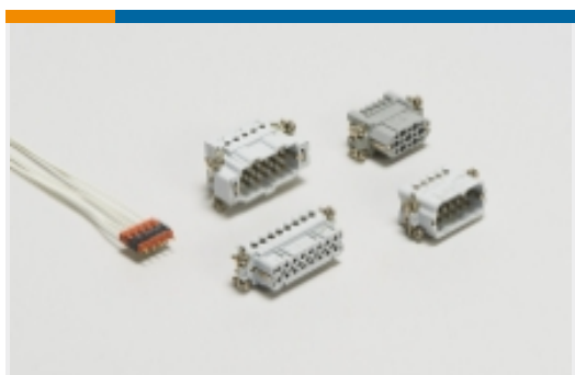
Rectangular Contact Inserts(119)