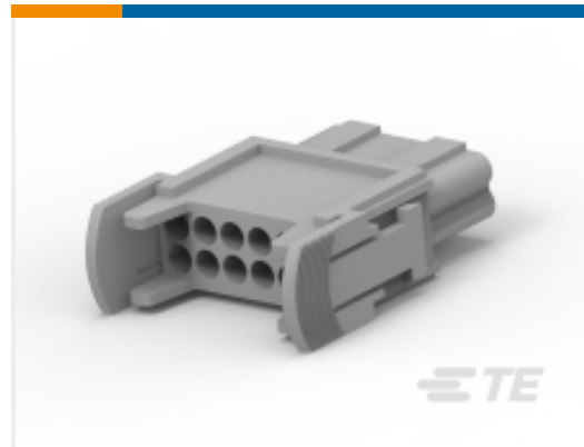
TE Part #T2111122201-000 HMN-012-F