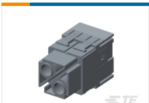
TE Part #T2111028201-000 HMN-D2-FC