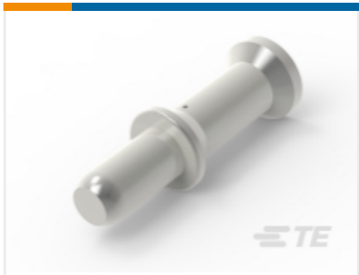
TE Part #T2050001016-000 CNM-16