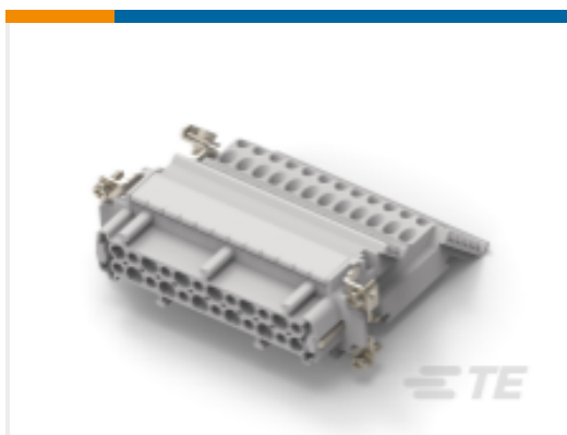
TE Part #T2100243201-000 HEAV-024-FS