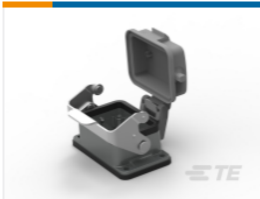
TE Part #T1510062100-000 H6B-ADS