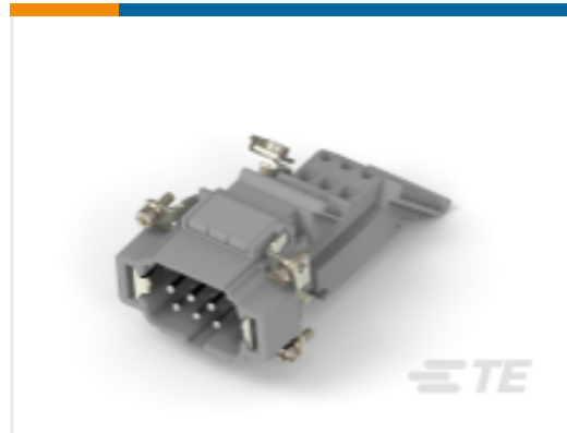
TE Part #T2100063101-000 HEAV-006-MS