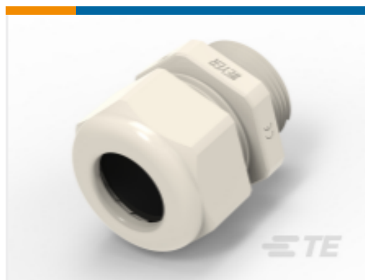
TE Part #T3209211211-000 HSK-P21G-H