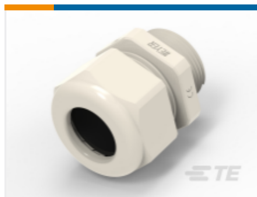
TE Part #T3209401222-001 HSK-M40G