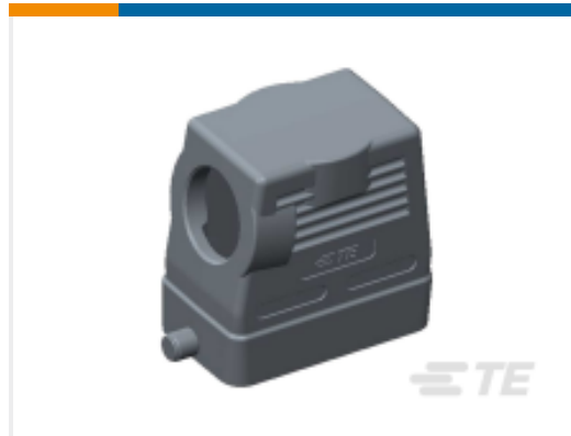
TE Part #T1330100121-000 H10B-TSH-RO-PG21