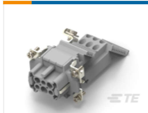
TE Part #T2100063201-000 HEAV-006-FS