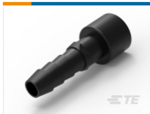
TE Part # T2090002201-003 PNEU-C-F4.0