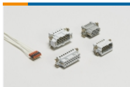
Rectangular Contact Inserts(119)