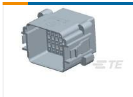
TE Part #2013393-1 ME CONN MOLD TYPE TAB HSG 32POS ASSY R