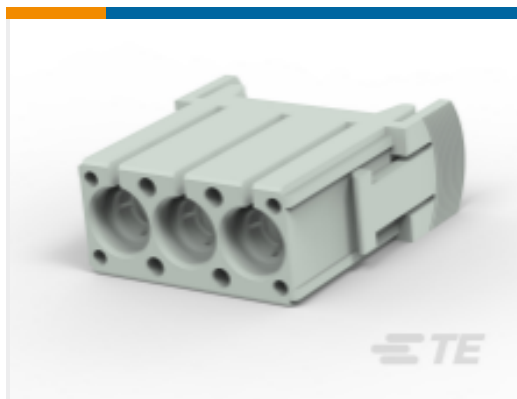
TE Part # T2111032301-000 HMN-PA3