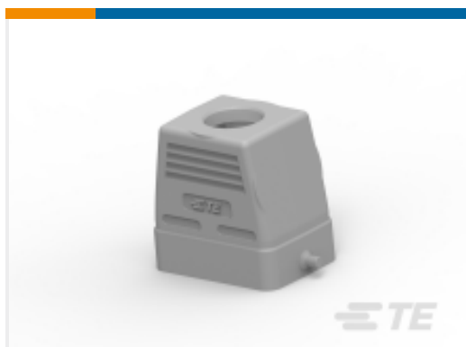
TE Part #T1320060116-000 H6B-TG-PG16