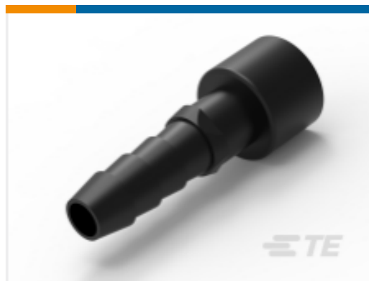
TE Part # T2090012201-003 PNEU-C-FW4.0