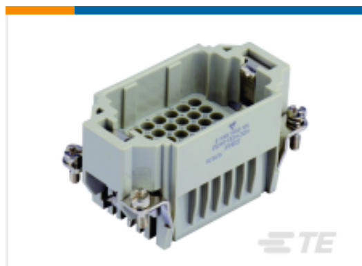
TE Part #T2030422101-000 HDD-042-M