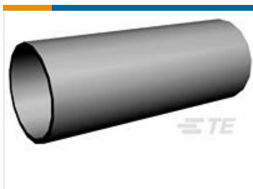
TE Part #4-745130-0 SHLDING FERRULE,PLTD,BULK PKG