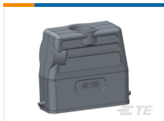
TE Part #T1349160121-000 H16A-TGH-PG21