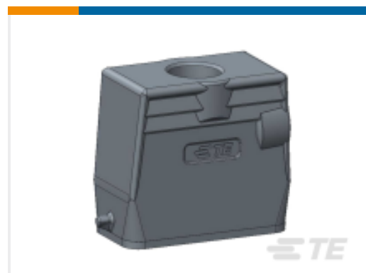
TE Part #T1329100125-000 H10A-TG-M25