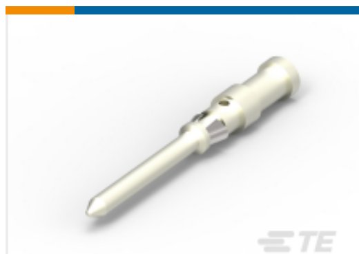
TE Part #T2020001015-000 CDM-1.5