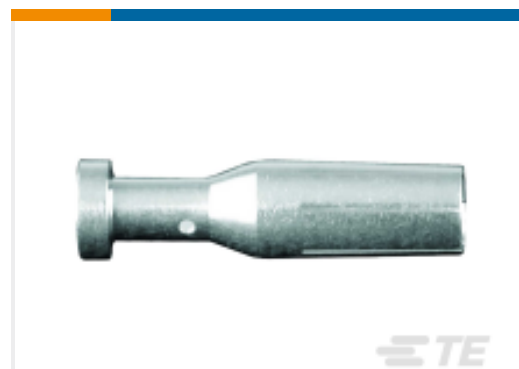
TE Part #T2040002060-000 CMF-6.0