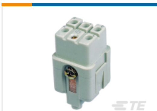
TE Part #T2080052201-000 HQ-005-F