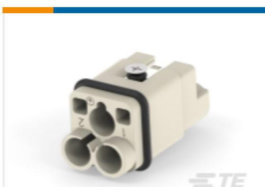
TE Part #T2080023101-000 HQ-002-PM