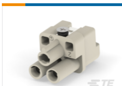
TE Part #T2080023201-000 HQ-002-PF