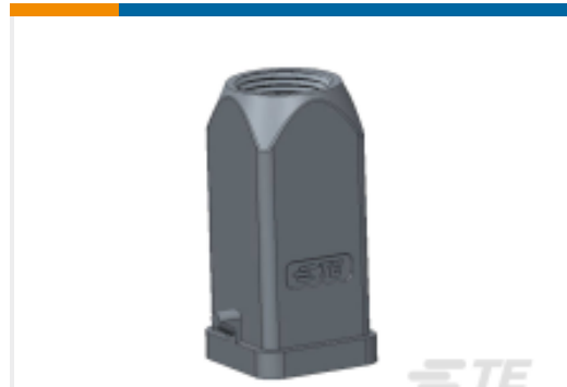
TE Part #T1329030120-000 H3A-MTG-M20