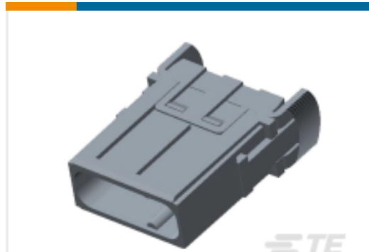
TE Part #T2111032101-000 HMN-003-M