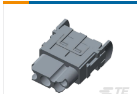
TE Part #T2111032201-000 HMN-003-F