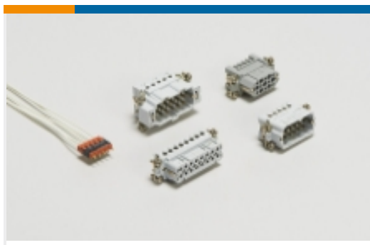
Rectangular Contact Inserts(15)