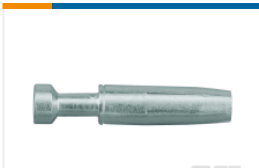
TE Part #T2030002008-000 CEF-0.75