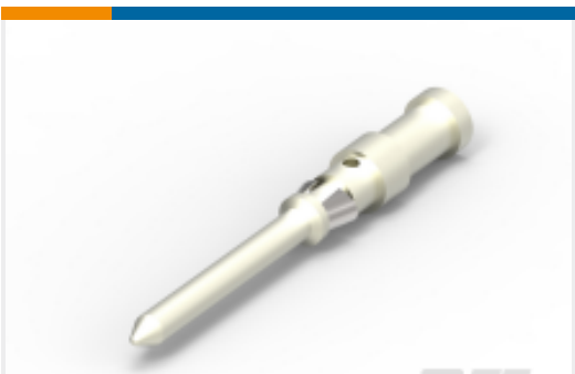
TE Part #T2020001015-000 CDM-1.5