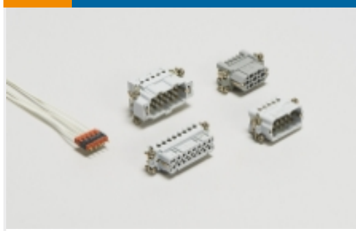
Rectangular Contact Inserts(15)