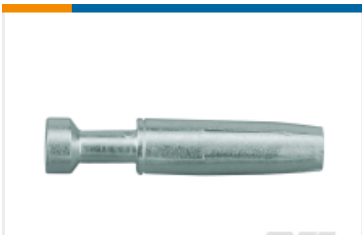
TE Part #T2030002040-000 CEF-4.0