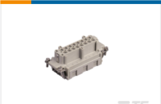
TE Part #T2040163201-000 HE-016-FS