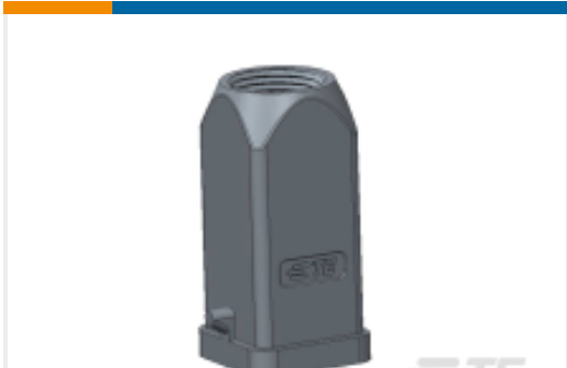
TE Part #T1329030120-000 H3A-MTG-M20