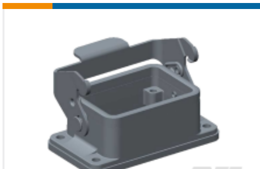
TE Part #T1500063000-000 H6B-AG