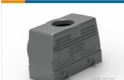
TE Part #T1220160125-000 H16B-TG-M25