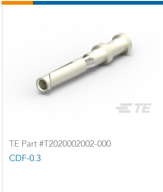
TE Part #T2020002002-000 CDF-0.3