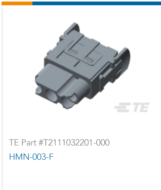
TE Part #T2111032201-000 HMN-003-F