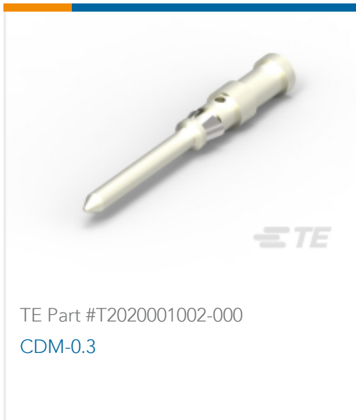
TE Part #T2020001002-000 CDM-0.3