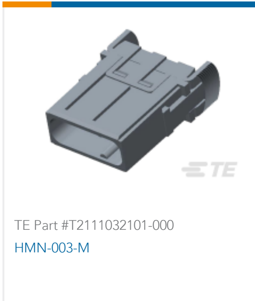
TE Part #T2111032101-000 HMN-003-M