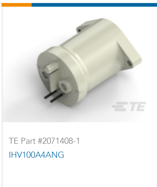
TE Part #2071408-1 IHV100A4ANG