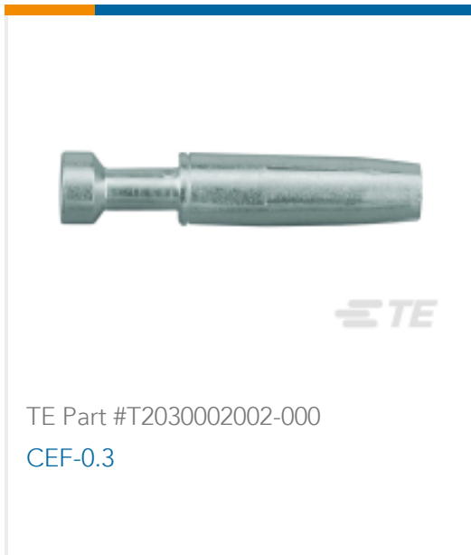
TE Part #T2030002002-000 CEF-0.3