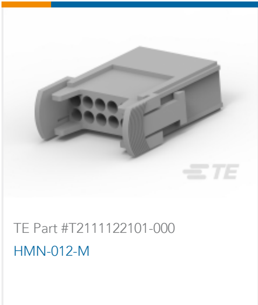
TE Part #T2111122101-000 HMN-012-M