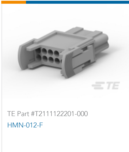
TE Part #T2111122201-000 HMN-012-F