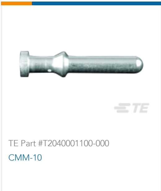
TE Part #T2040001100-000 CMM-10