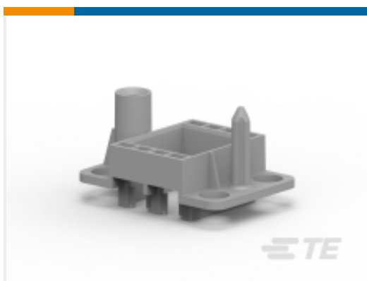
TE Part #T2071064101-000 H6BP-T2-M DOCKING FRAME_FLOATING