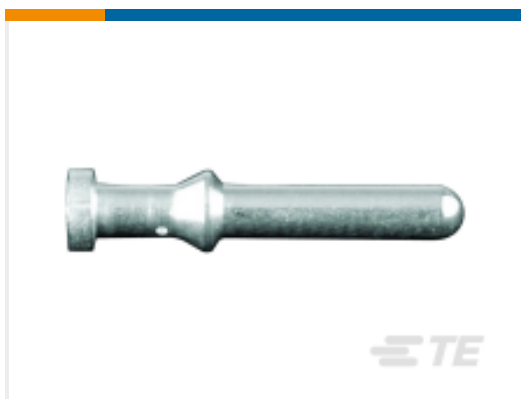
TE Part #T2040001100-000 CMM-10