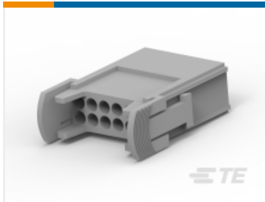
TE Part #T2111122101-000 HMN-012-M