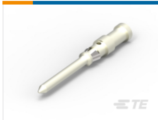
TE Part #T2020001002-000 CDM-0.3