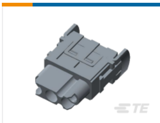
TE Part #T2111032201-000 HMN-003-F