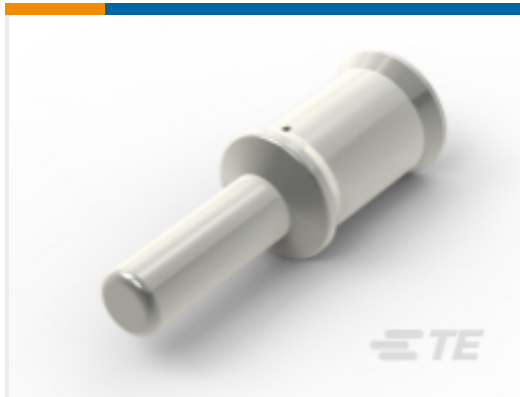
TE Part #T2400001100-000 CSM-10