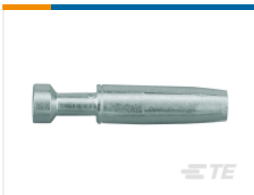
TE Part #T2030002002-000 CEF-0.3