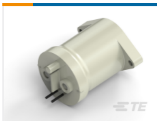
TE Part #2071408-1 IHV100A4ANG