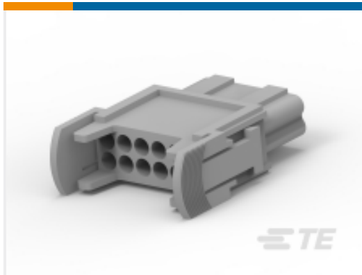
TE Part #T2111122201-000 HMN-012-F