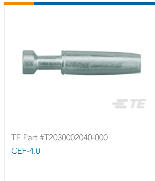
TE Part #T2030002040-000 CEF-4.0