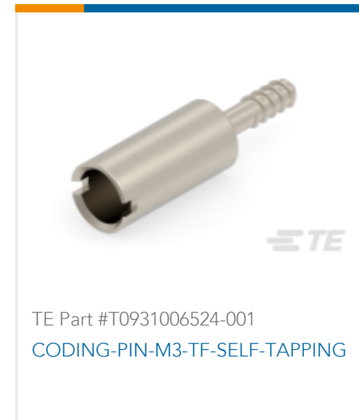
TE Part #T0931006524-001 CODING-PIN-M3-TF-SELF-TAPPING