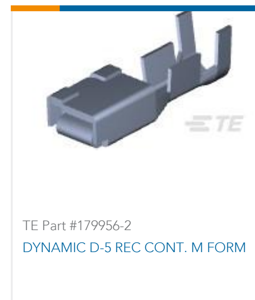
TE Part #179956-2 DYNAMIC D-5 REC CONT. M FORM