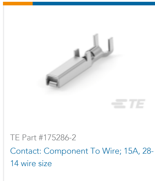
TE Part #175286-2 Contact: Component To Wire; 15A, 28- 14 wire size