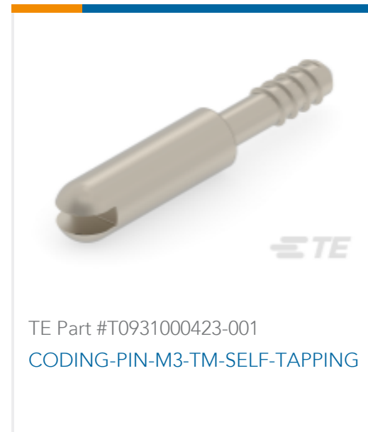
TE Part #T0931000423-001 CODING-PIN-M3-TM-SELF-TAPPING