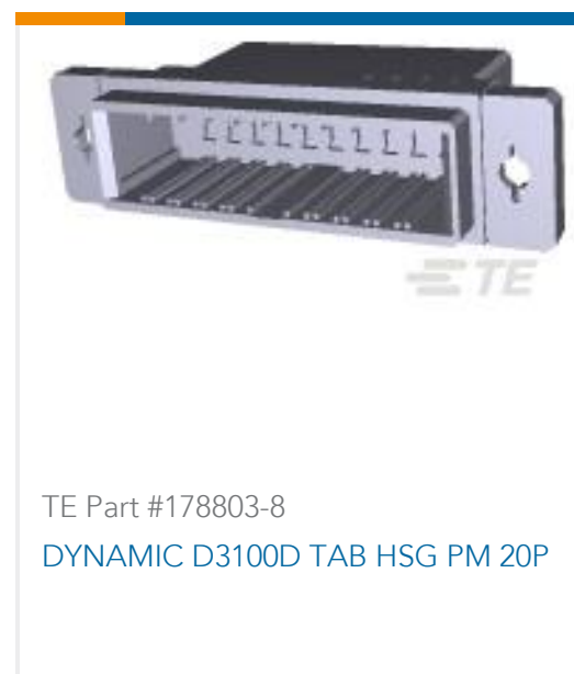
TE Part #178803-8 DYNAMIC D3100D TAB HSG PM 20P