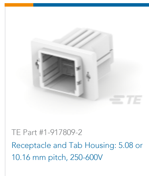
TE Part #1-917809-2 Receptacle and Tab Housing: 5.08 or 10.16 mm pitch, 250-600V