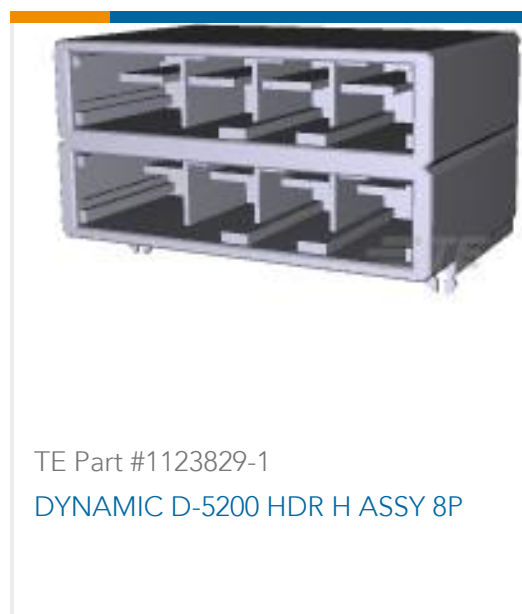
TE Part #1123829-1 DYNAMIC D-5200 HDR H ASSY 8P