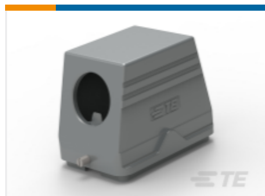
TE Part # T1310480150-000 H48B-TS-RO-M50