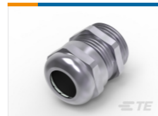
TE Part # T3609500112-000 DLX-50-MT