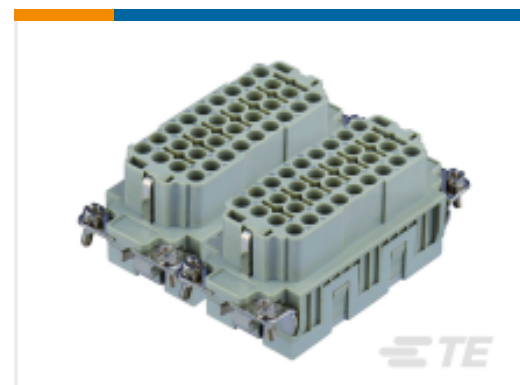
TE Part # T2051283201-000 HEEE-064-F 65-128