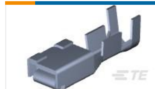
TE Part #179956-2 DYNAMIC D-5 REC CONT. M FORM