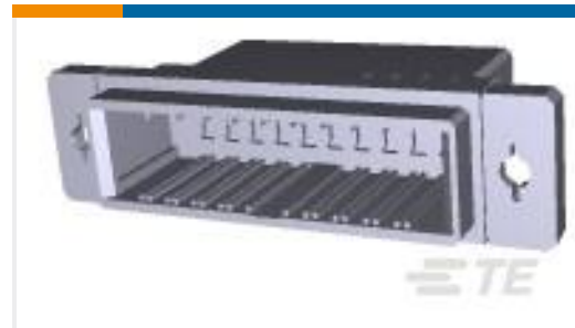
TE Part #178803-8 DYNAMIC D3100D TAB HSG PM 20P