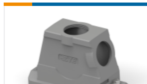
TE Part #T1A40242240-000 H24BPR-TG/SA-2M40