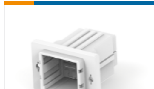
TE Part #1-917809-2 Receptacle and Tab Housing: 5.08 or 10.16 mm pitch, 250-600V