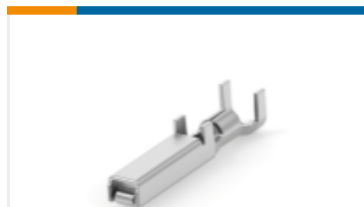
TE Part #175286-2 Contact: Component To Wire; 15A, 28- 14 wire size