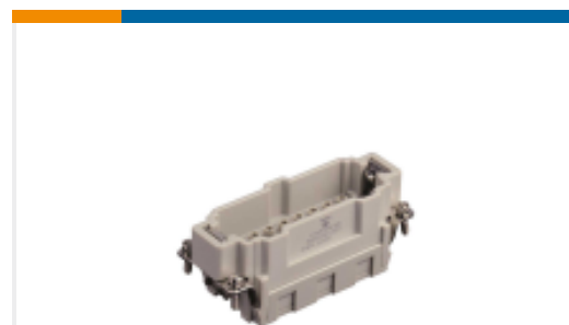
TE Part #T2040164101-000 HE-016-MC