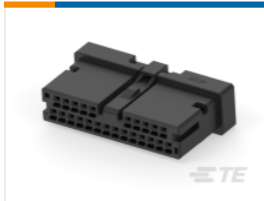
TE Part #2-2834461-4 MINI DYNAMIC REC HSG ASSY 24P X-KEY BLK