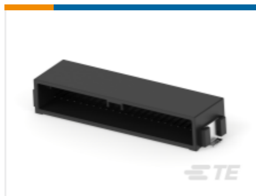
TE Part #4-2834465-0 MINI DYNAMIC HDR H 40P TIN X-KEY BLK