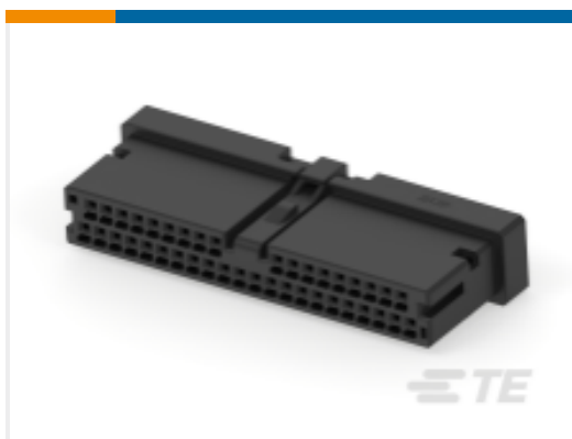
TE Part #4-2834461-0 MINI DYNAMIC REC HSG ASSY 40P X-KEY BLK