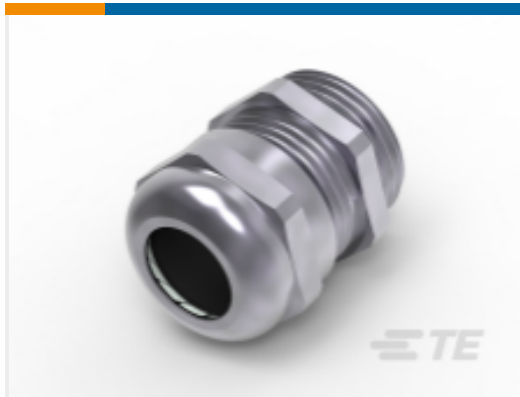
TE Part #T3609400112-000 DLX-40-MT