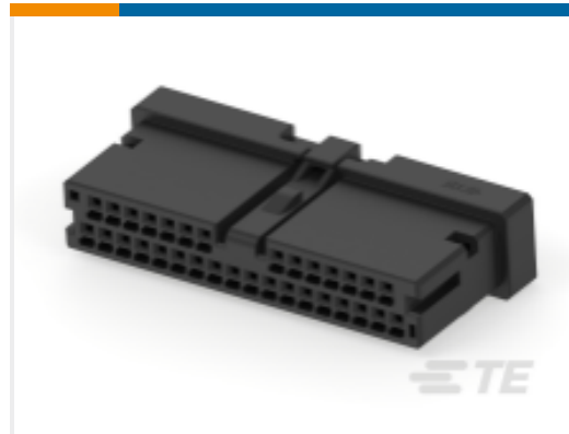
TE Part #3-2834461-2 MINI DYNAMIC REC HSG ASSY 32P X-KEY BLK