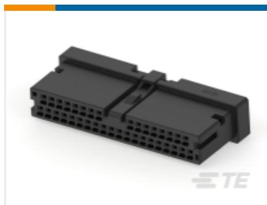
TE Part #3-2834461-6 MINI DYNAMIC REC HSG ASSY 36P X-KEY BLK