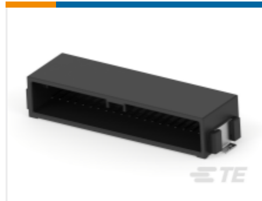
TE Part #3-2834465-6 MINI DYNAMIC HDR H 36P TIN X-KEY BLK