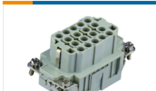
TE Part #T2050182201-000 HEE-018-F