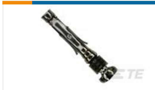
TE Part #66598-9 III+ SKT,18-14,TIN ,STRIP