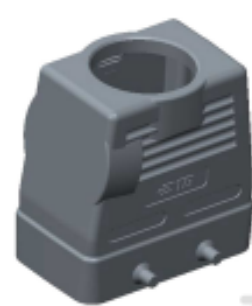
TE Part # T1240100121-000 H10B-TGH-PG21