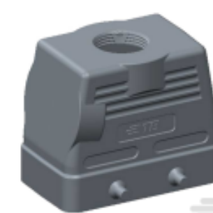
TE Part # T1230100129-000 H10B-TSH-PG29