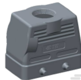
TE Part # T1220100125-000 H10B-TG-M25