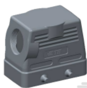
TE Part # T1210100125-000 H10B-TS-M25