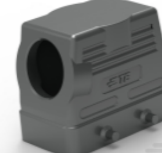
TE Part # T1210100121-000 H10B-TS-PG21