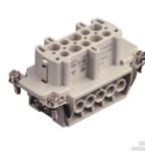
TE Part # T2040102201-000 HE-010-F