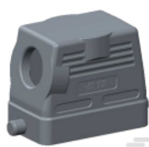
TE Part # T1310100116-000 H10B-TS-RO-PG16