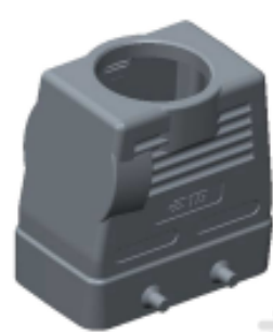
TE Part # T1240100129-000 H10B-TGH-PG29