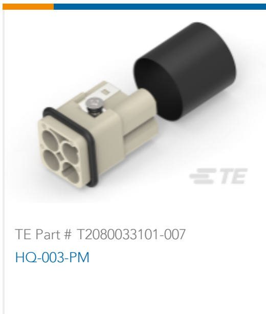
TE Part # T2080033101-007 HQ-003-PM