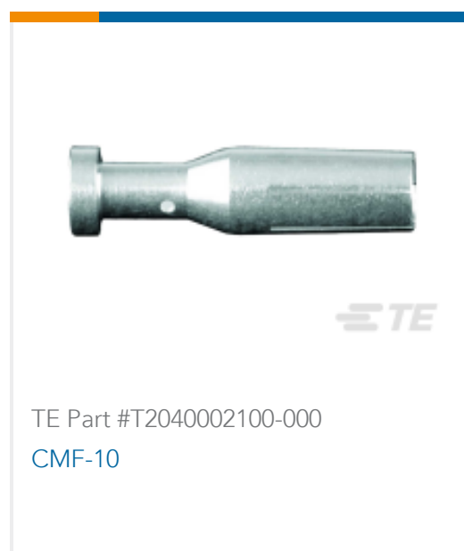
TE Part #T2040002100-000 CMF-10