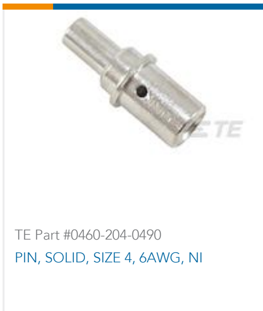
TE Part #0460-204-0490 PIN, SOLID, SIZE 4, 6AWG, NI