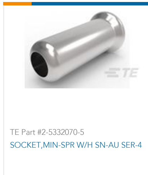
TE Part #2-5332070-5 SOCKET,MIN-SPR W/H SN-AU SER-4