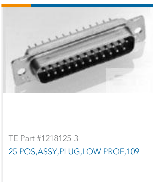
TE Part #1218125-3 25 POS,ASSY,PLUG,LOW PROF,109