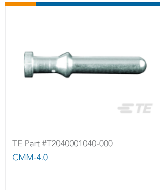
TE Part #T2040001040-000 CMM-4.0