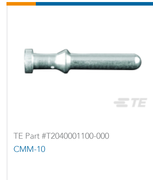
TE Part #T2040001100-000 CMM-10