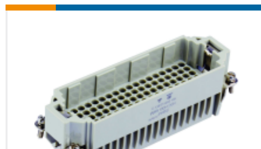
TE Part #T2031082101-000 HDD-108-M