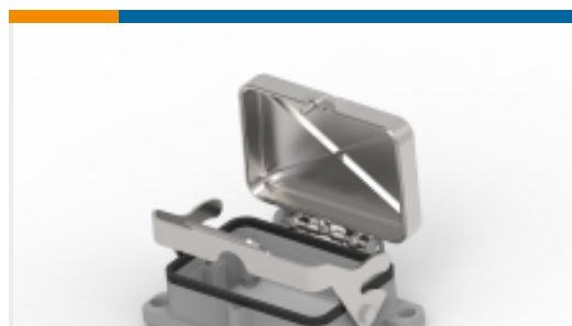
TE Part #T1510482000-000 H48B-AD-LB