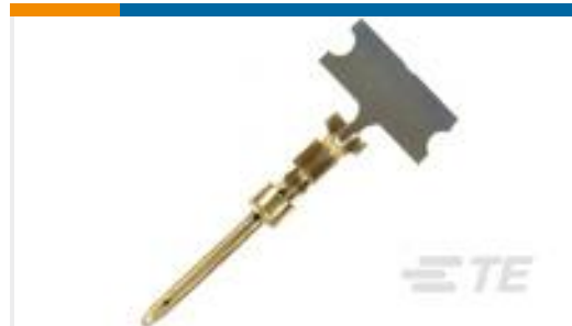
TE Part #66506-4 HD 20 DF PIN PLTD