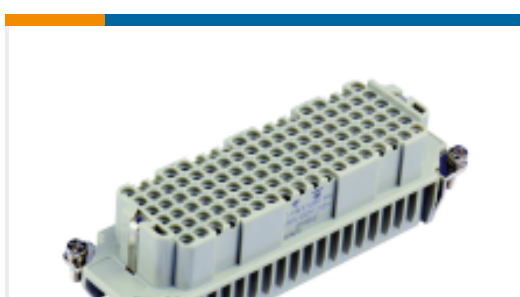
TE Part #T2031082201-000 HDD-108-F