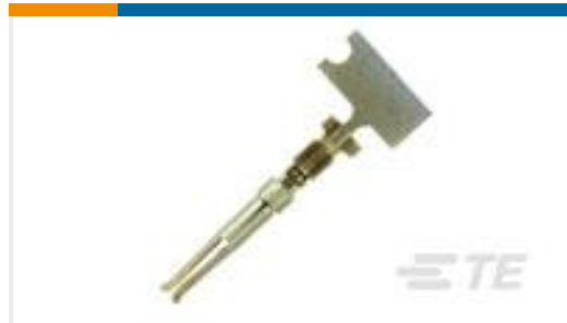
TE Part #1-66504-0 SOCKET CONTACT, 20 DF