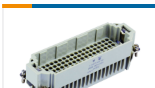
TE Part #T2032162101-000 HDD-108-M 109-216